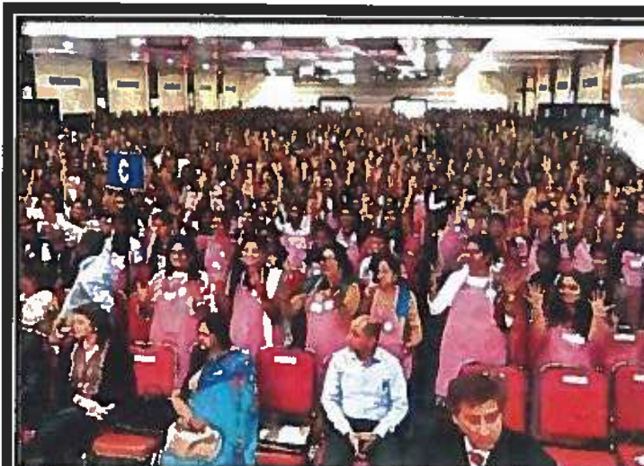
मुंबईचा दान इन्सटिट्यूट ऑफ मॅनेजमेंटच्या वतीने आयोजित झालेल्या 'दोन हजार महिलांचा विक्रम' या उपक्रमामध्ये सहभागी झालेल्या महिलांचा एकत्रित चित्र. यावेळी महिलांनी आपापसांत प्रेम आणि समर्थन व्यक्त करिते असल्याचे दिसून येते.