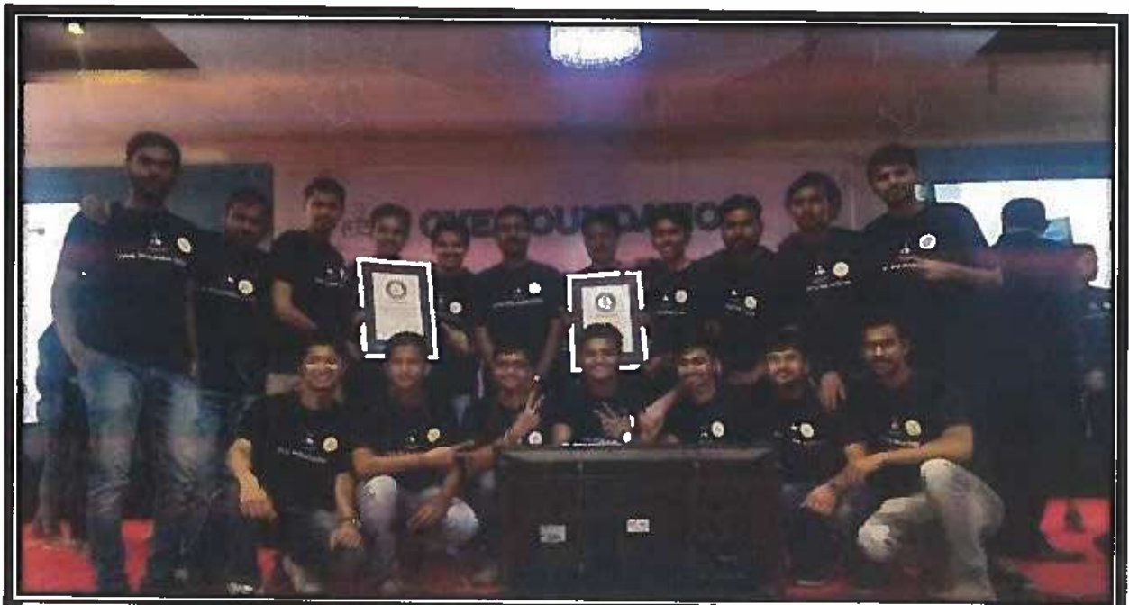
Proud Team of SBPIM Volunteers along with 2 Guinness World records Awarded to OYE Foundation's on Breast Cancer Awareness on Sunday, 11th Feb 2018 at Deccan College, Pune