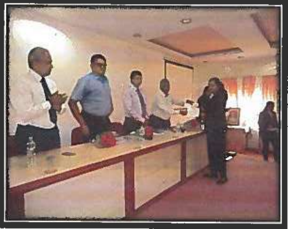
The guest giving away the prizes to the winners.