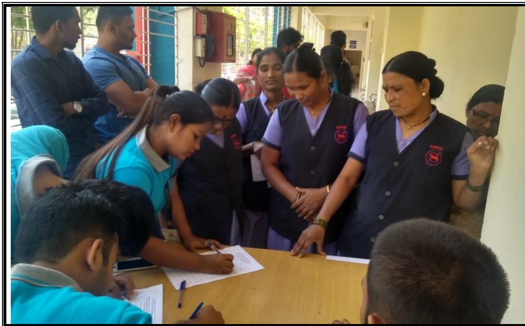
Housekee ping staff registering for the Health checkup camp