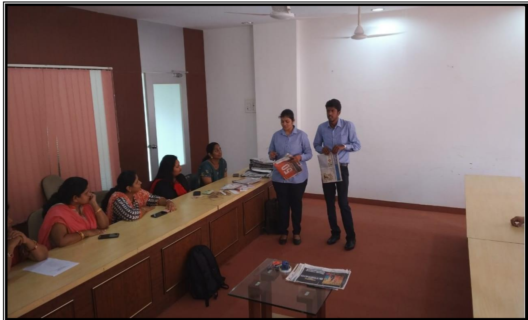
Students explaining the process of making paper bags