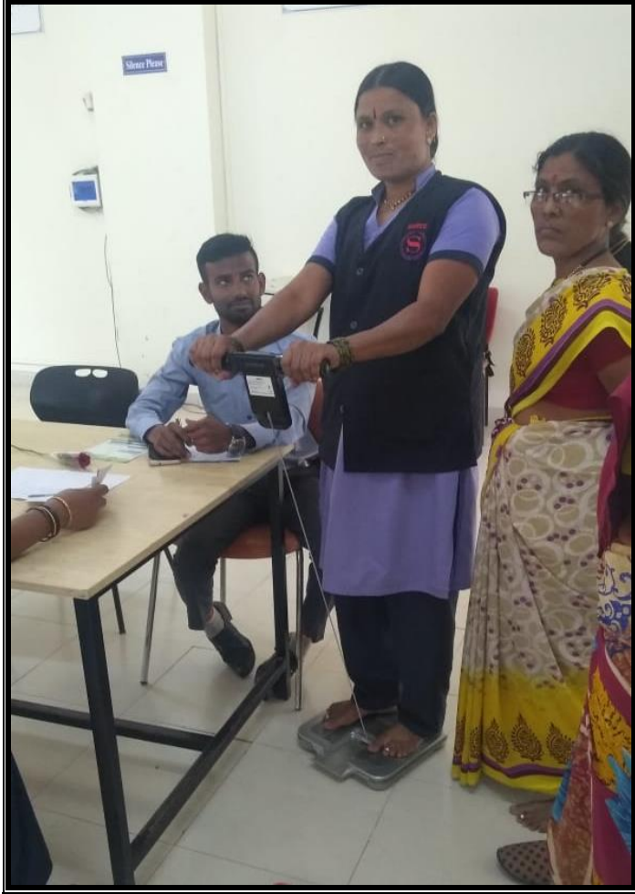
Body Mass Index Checkup