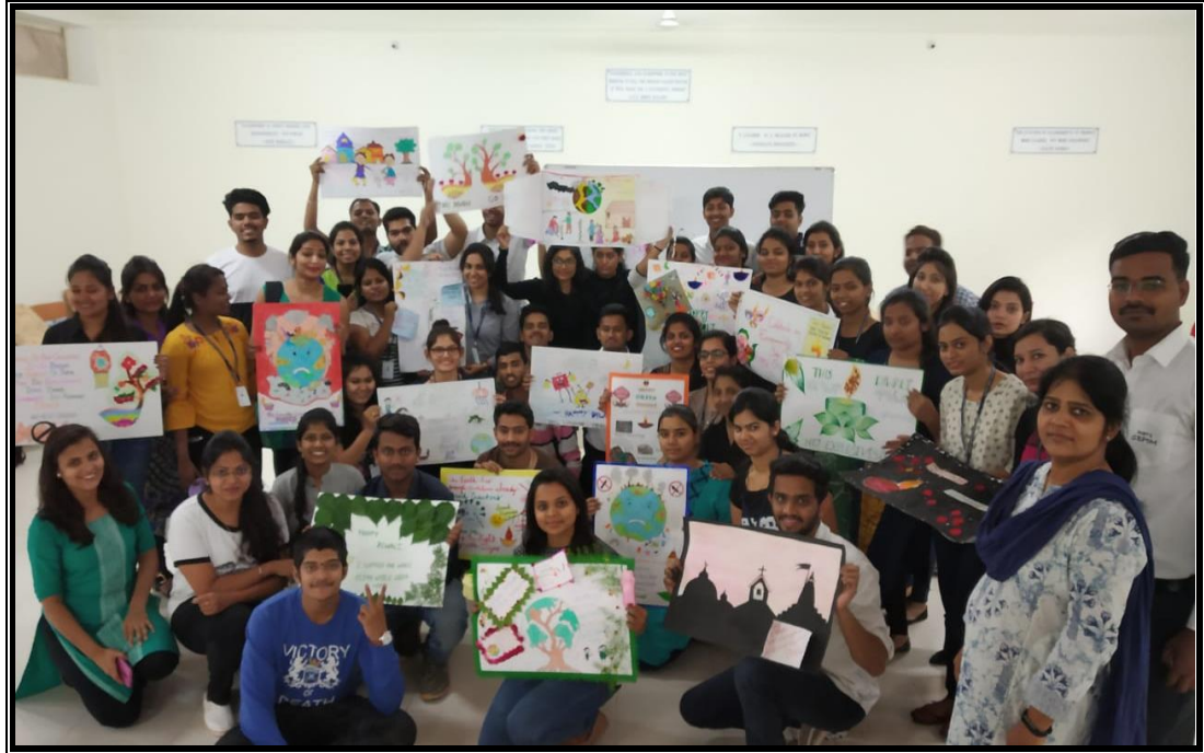
Students displaying their charts