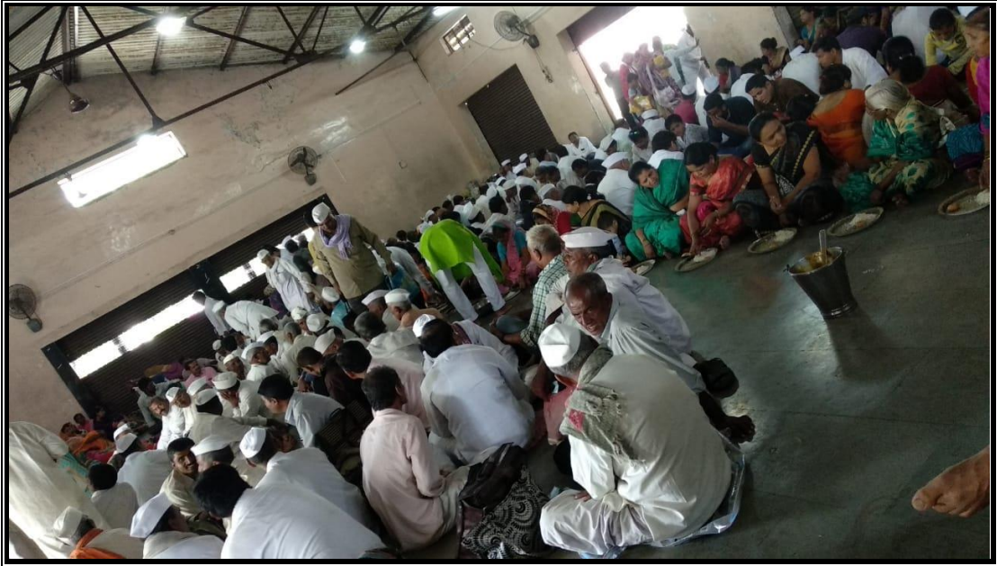
Devotees having food