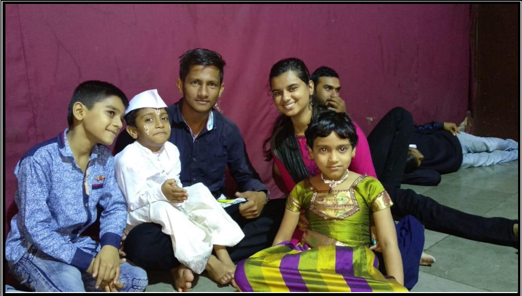
Students with young devotees

helped in cleaning the premises by picking up the left overs, paper glasses and paper plates