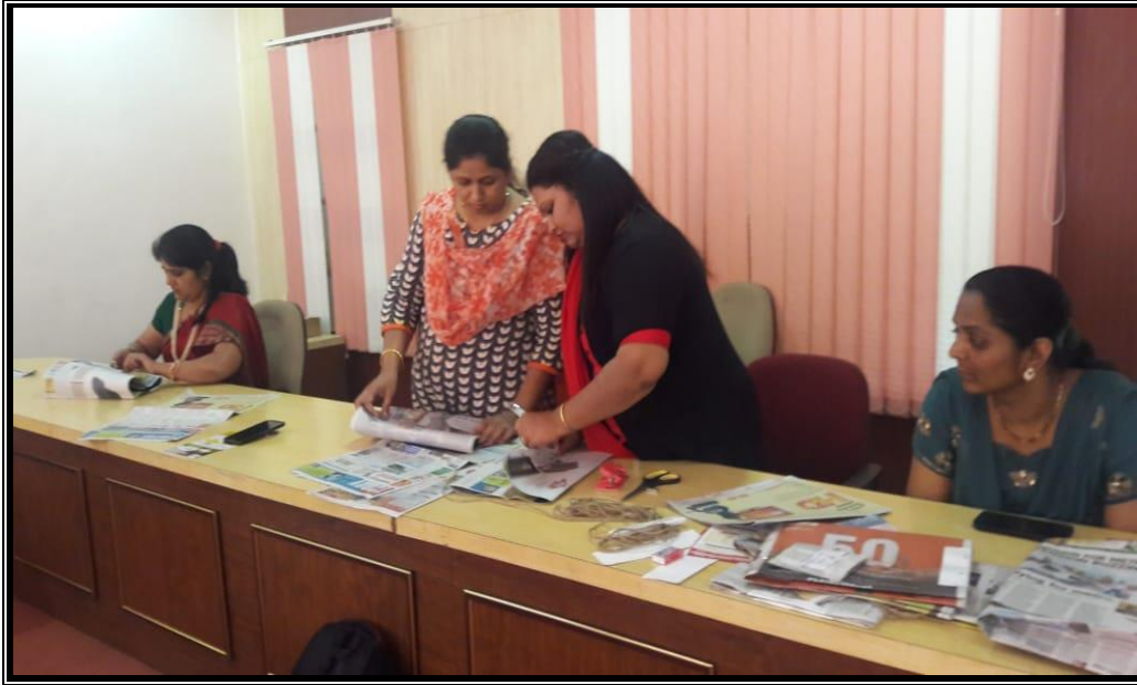
Faculty members engrossed in making paper bags