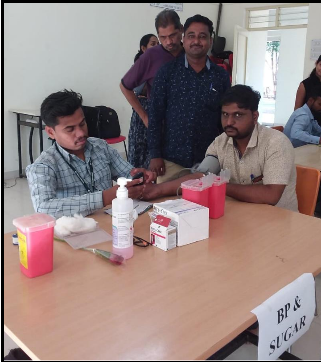
Blood sugar and Blood pressure check