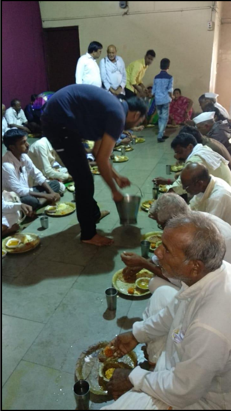
Student Volunteers distributing the food to the devotees