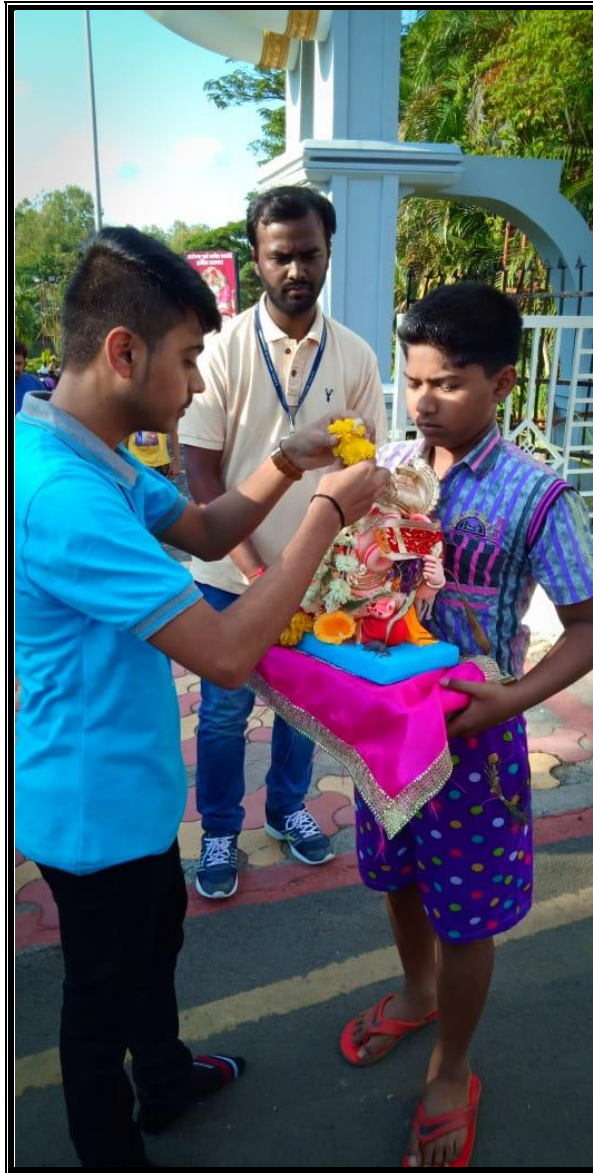
Students helping the devotees to dispose the NIRMALYA