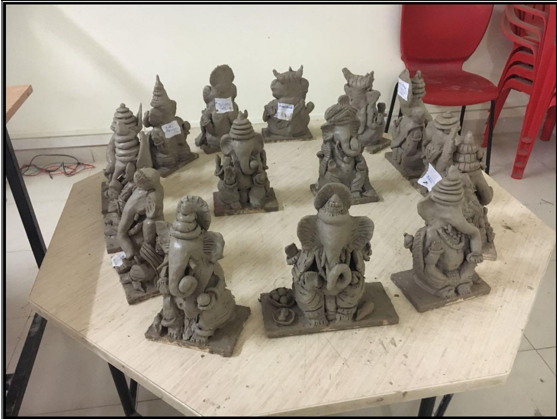
Some of the Idols Made by the staff and the students