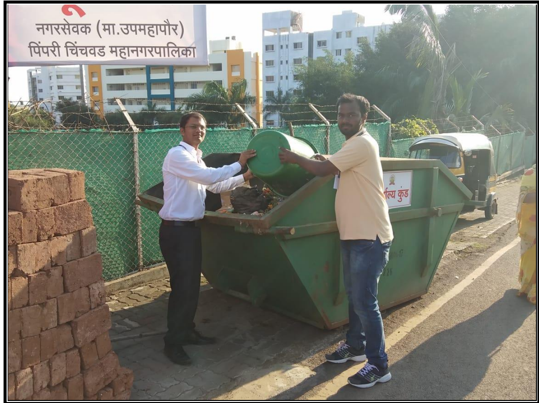
Students helping in disposing the waste appropriately