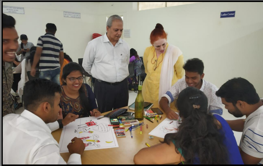
Judges observing the work of the students