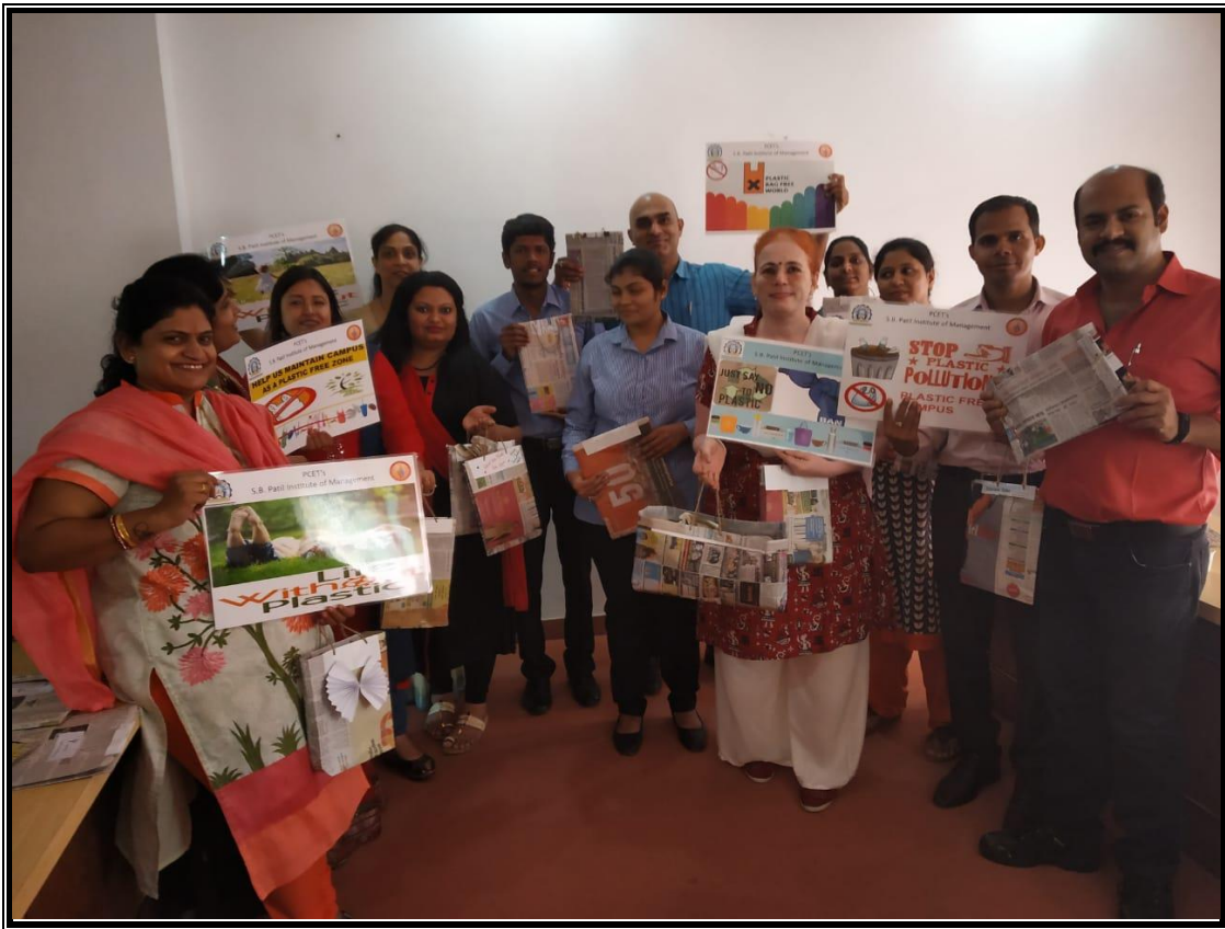
Faculty posing with their paper bags and SAY NO TO PLASTIC posters