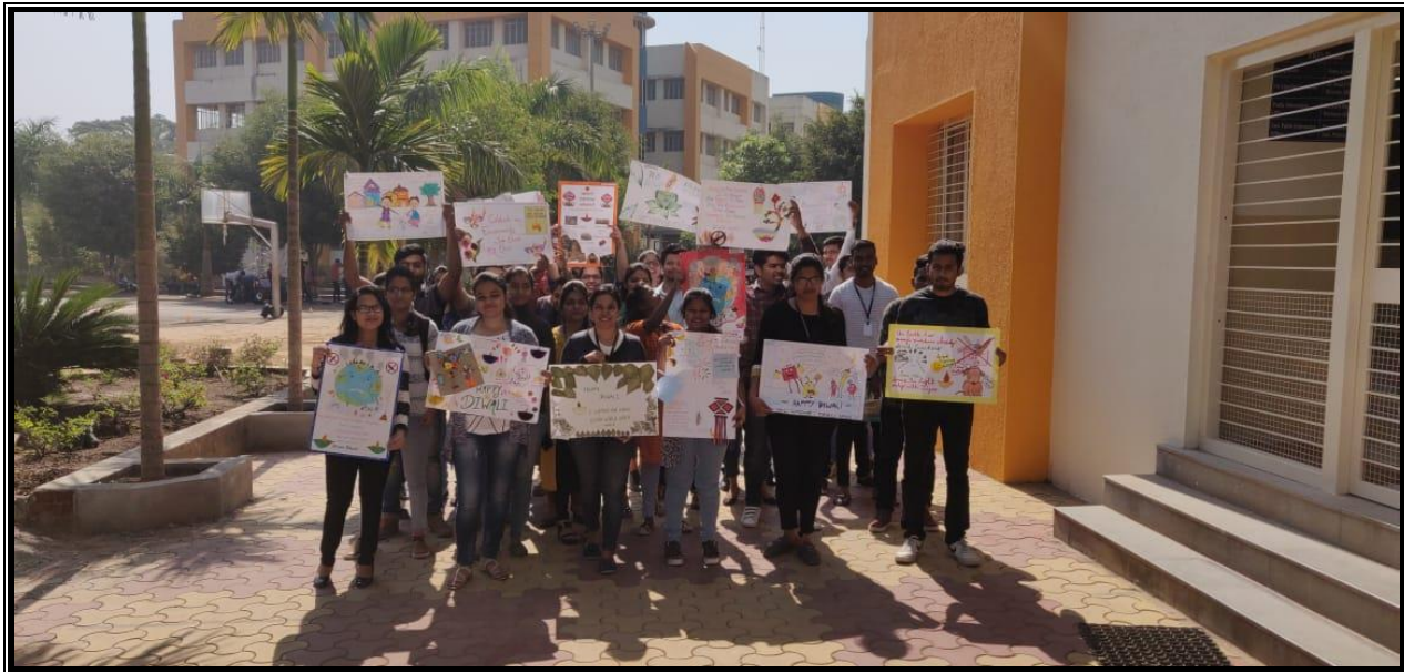
Students displaying the posters in the rally