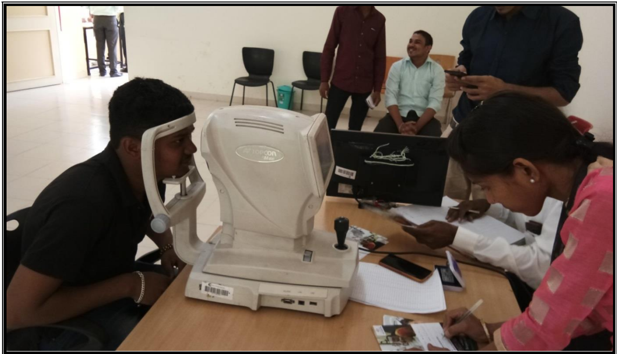
Eye Check Up