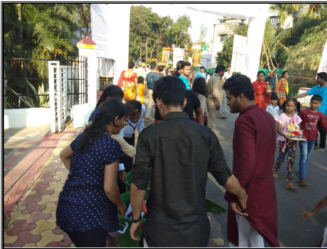
Students guiding the devotees