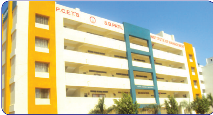
S. B. Patil Institute of Management ( www.sbpatilmba.com )