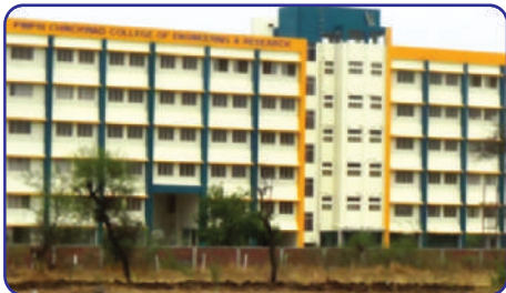
Pimpri Chinchwad College of Engineering & Research ( www.pccoer.com )