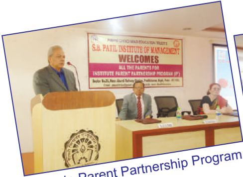
Institute Parent Partnership Program (IP3)