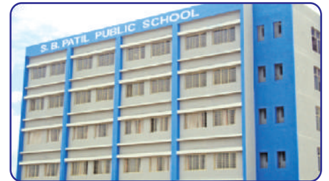
S. B. Patil Public School ( www.sbpatilschool.com )