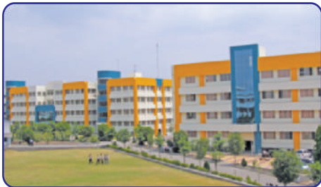
Pimpri Chinchwad College of Engineering ( www.pccoepune.com )