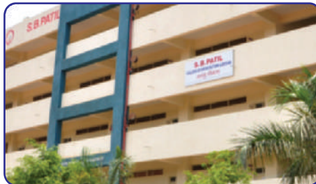
S. B. Patil College of Architecture & Design ( www.sbpatilarchitecture.com )