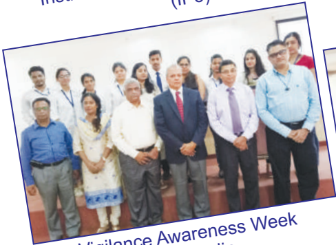
Vigilance Awareness Week by Air India