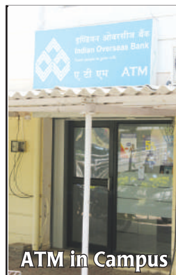
ATM in Campus