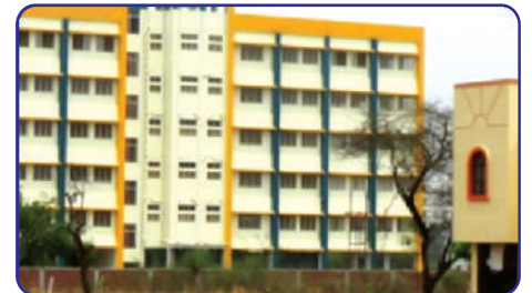
S. B. Patil College of Science & Commerce ( www.sbpatilcollege.com )