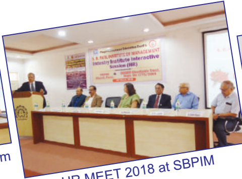
HR MEET 2018 at SBPIM