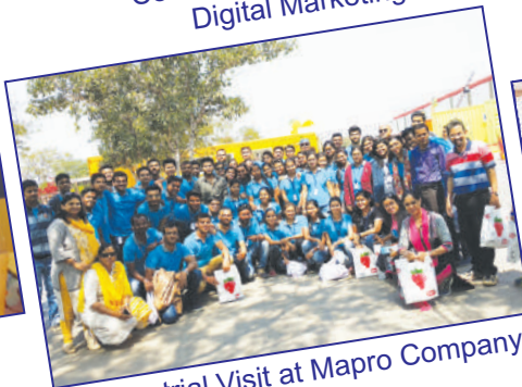
Industrial Visit at Mapro Company