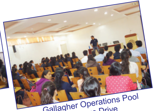
Gallagher Operations Pool Campus Drive