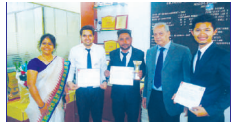
Students Achievements In Various Inter Collegiate Competitions Won 21 Prizes in 2017-18