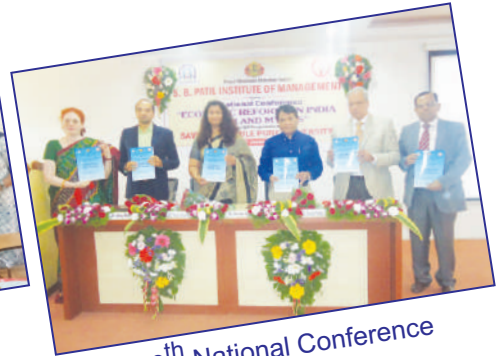
6th National Conference at SBPIM