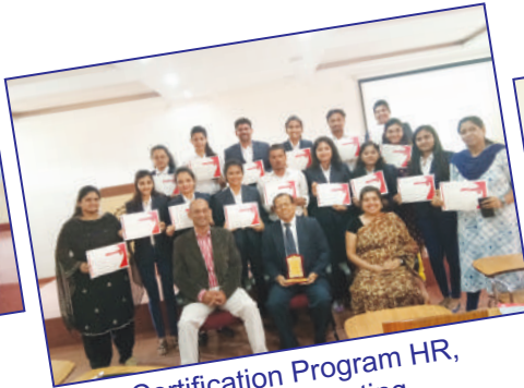
Certification Program HR, Digital Marketing