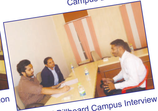
Beyond Billboard Campus Interview