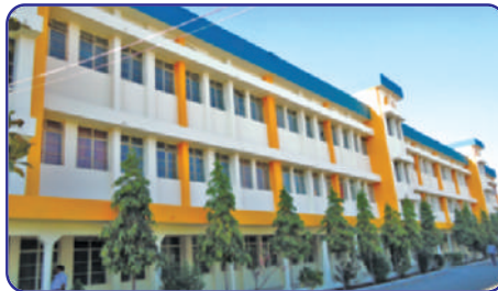
Pimpri Chinchwad Polytechnic ( www.pcpolytechnic.com )