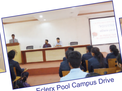
Eclerx Pool Campus Drive