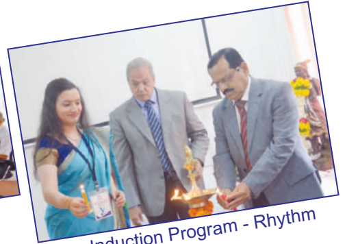
Induction Program - Rhythm