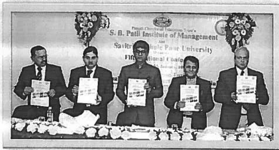
Release of Conference Proceedings and Edited Book Entitled “Rural Development- Trends, Opportunities And Challenges In 21 st Century”

In the Inauguration program the Conference Proceedings and edited book entitled “RURAL DEVELOPMENT- TRENDS, OPPORTUNITIES AND CHALLENGES IN 21 ST CENTURY” was inaugurated with the auspicious hands of guests.