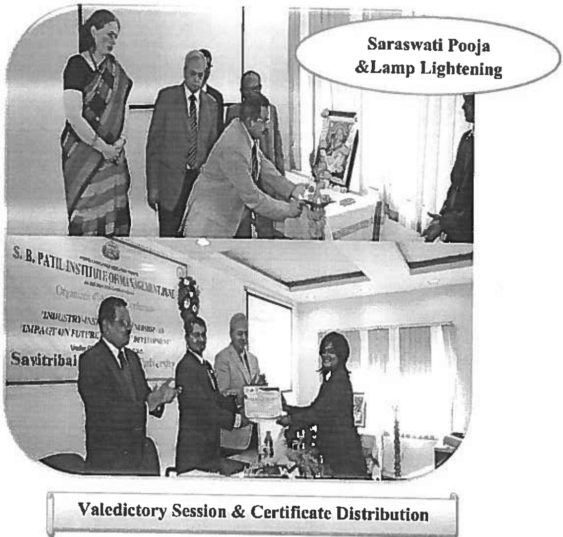
Saraswati Pooja & Lamp Lightening