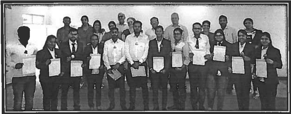
STUDENT COUNCIL MEMBERS

At SBPIM we promote students to work at various teams, encourage them to participate in the decision making process. This helps students to learn management and administrative skills outside the classroom too, enhance their personality and organization skill.