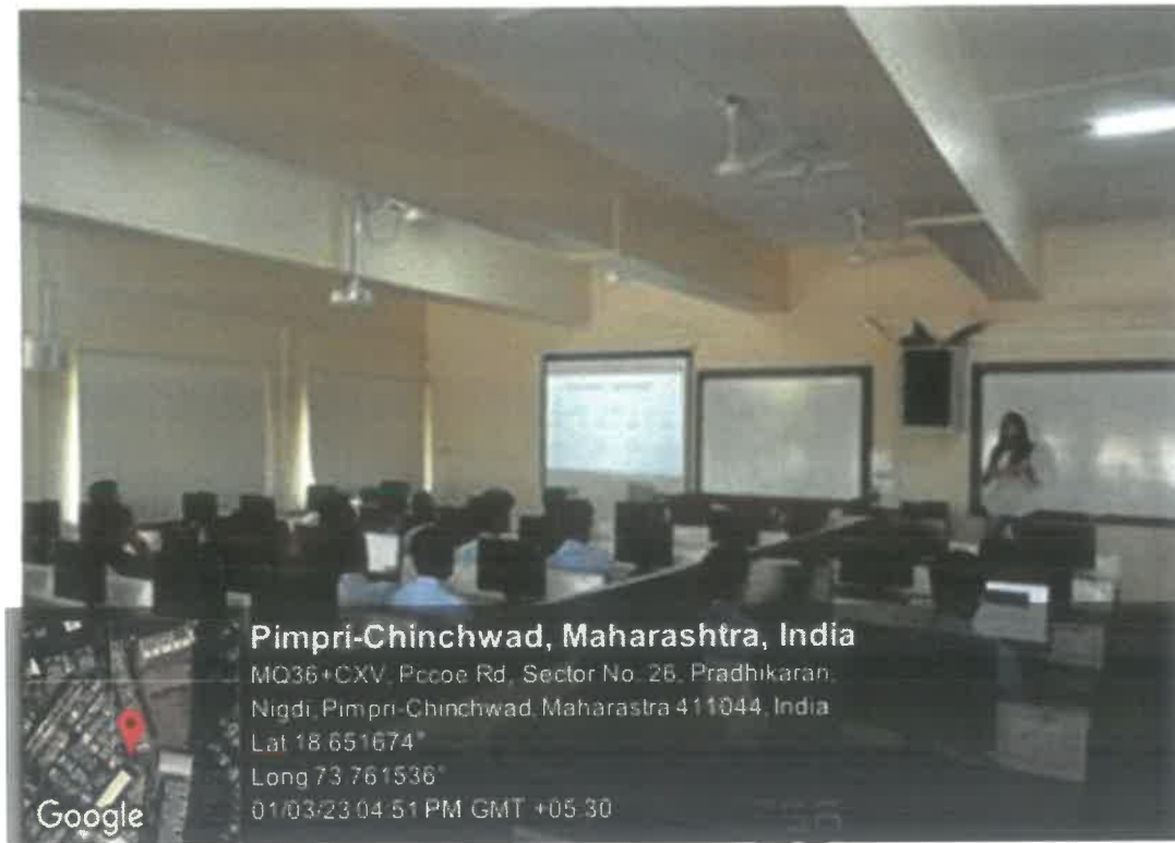
Career Guidance For Higher Education Abroad by AECC, Study Abroad Consultant