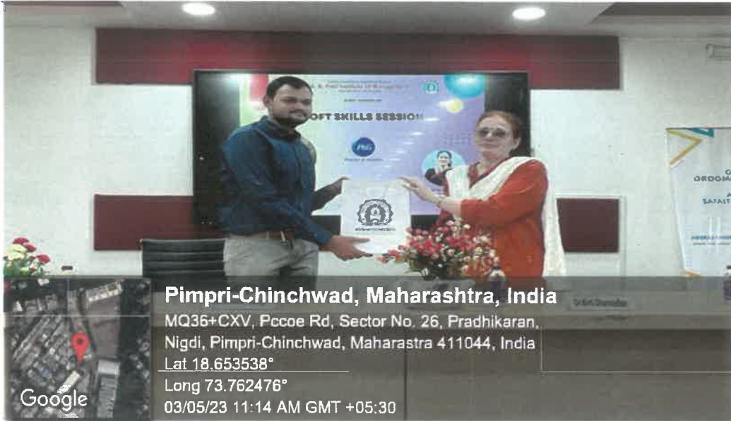
Felicitation of Guest