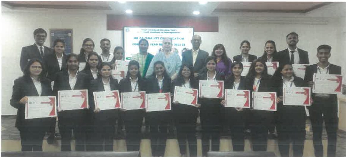
Group photo of the entire student participants along with their certificates