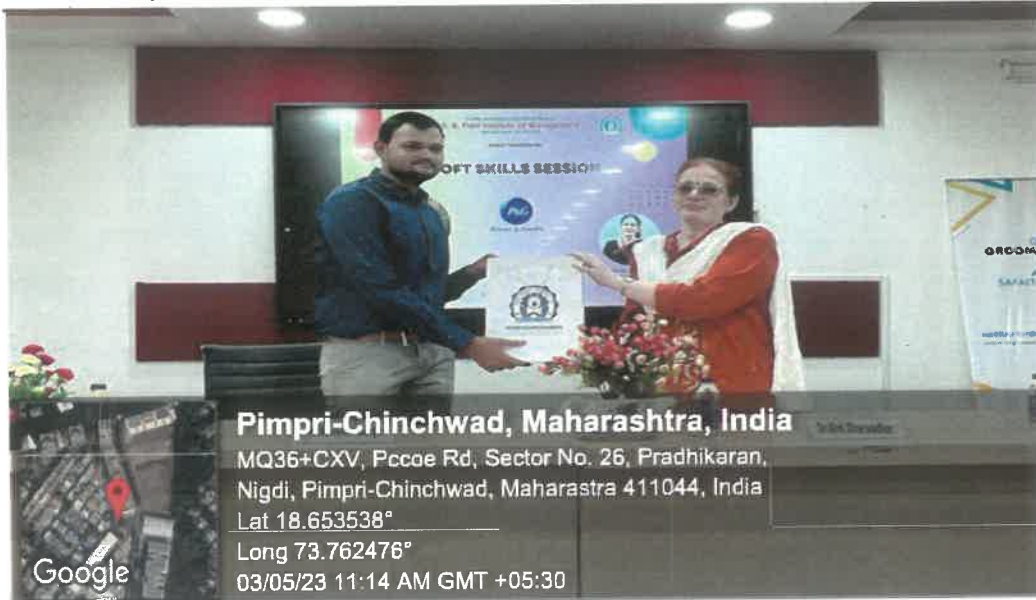
Felicitation of Guest