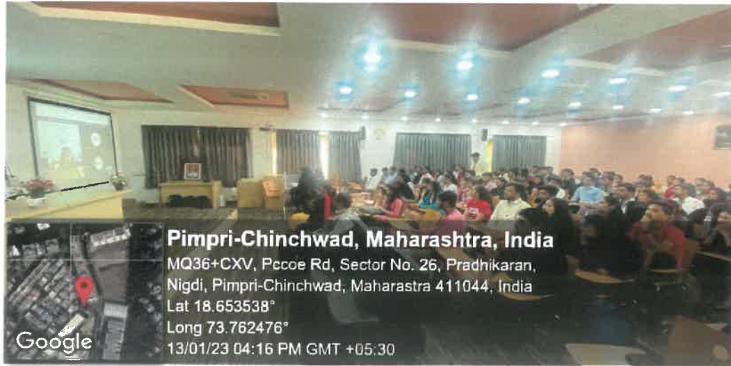
Guest addressing the audience