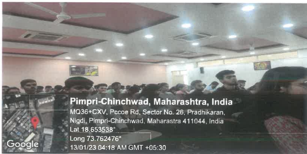
Students at the event