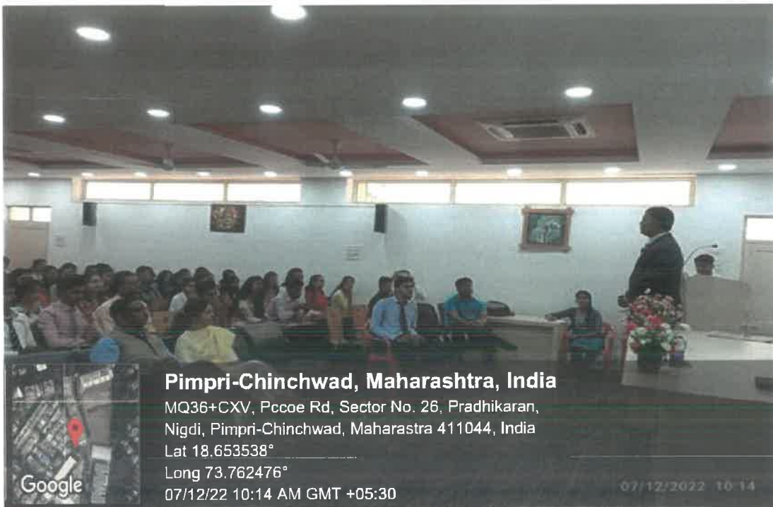
Speaker with students