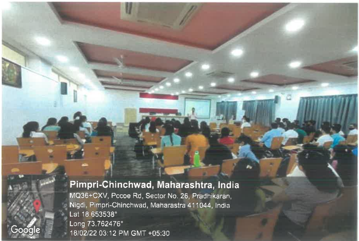
Guest Addressing students

Pimpri-Chinchwad, Maharashtra, India MQ36+CXV, Pccoe Rd, Sector No. 26, Pradhikaran, Nigdi, Pimpri-Chinchwad, Maharashtra 411044, India Lat 18.653538° Long 73.762476° 18/02/22 02:20 PM GMT +05:30