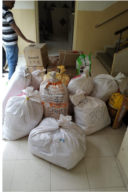
Food material , clothes, food grains and medicine packed and ready for donation