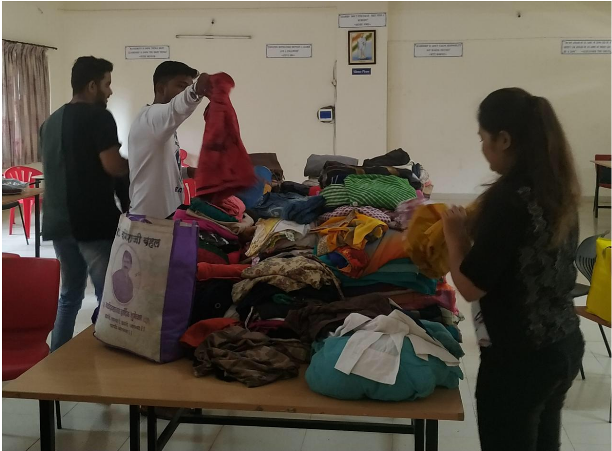
Students Collecting clothes for donation