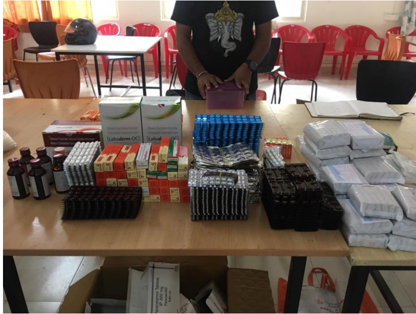
Medicines as requested by the Prathamik Arogya Kendra ,Savarde, Taluka Hatkanangale