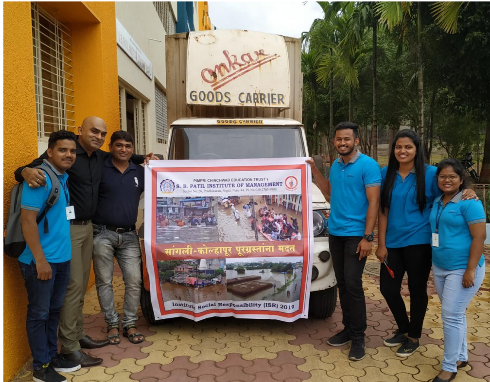
Students Ready with material to be donated