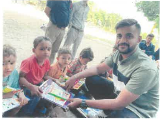
Student & faculty distributing books, colours and crayons to underprivileged Children.