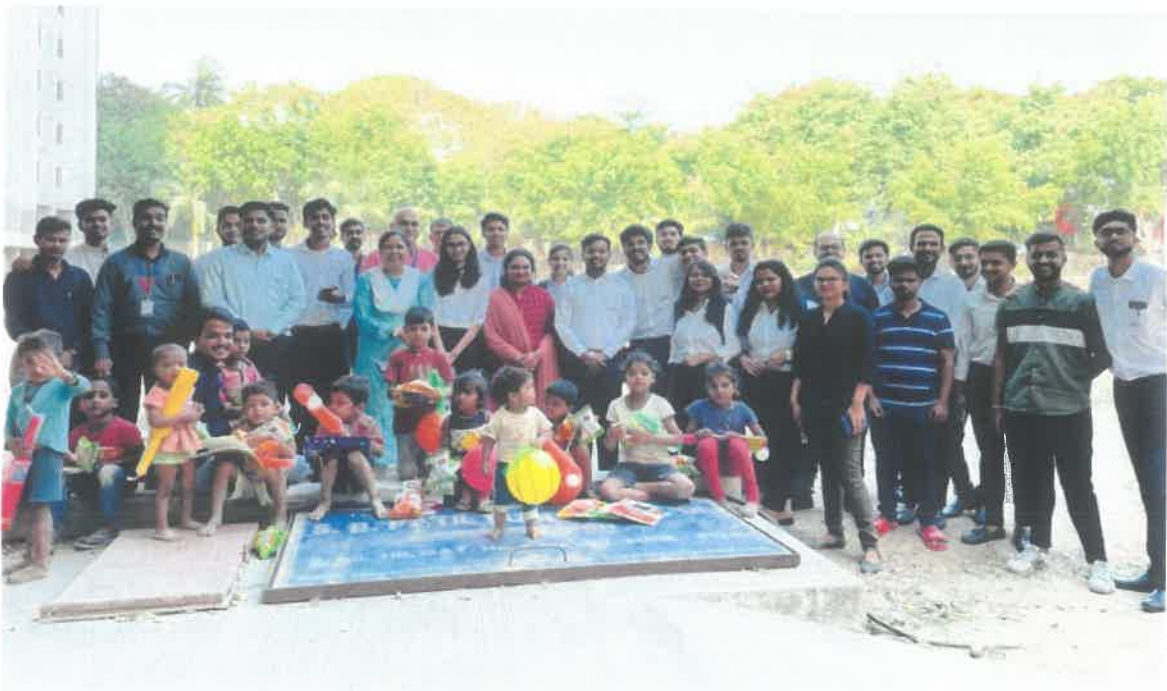
Happy faces: Smiles on each face