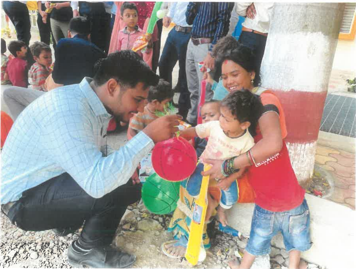
Students distributing toys to the young ones