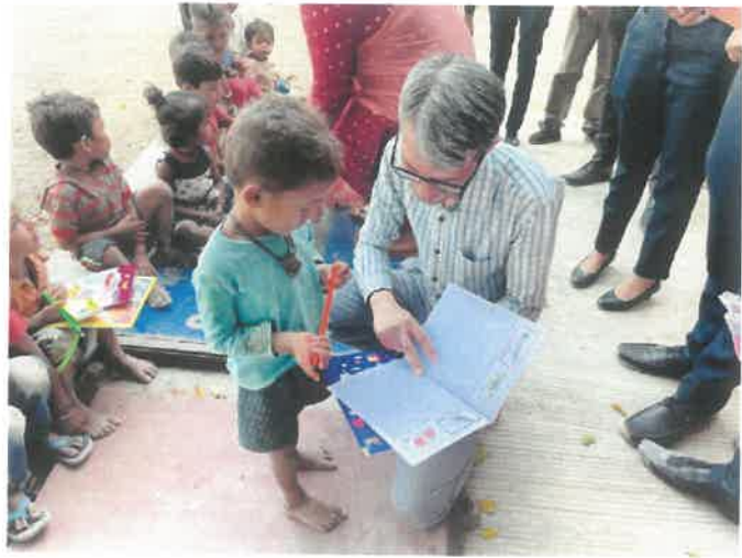
Students and Faculties helping students with books