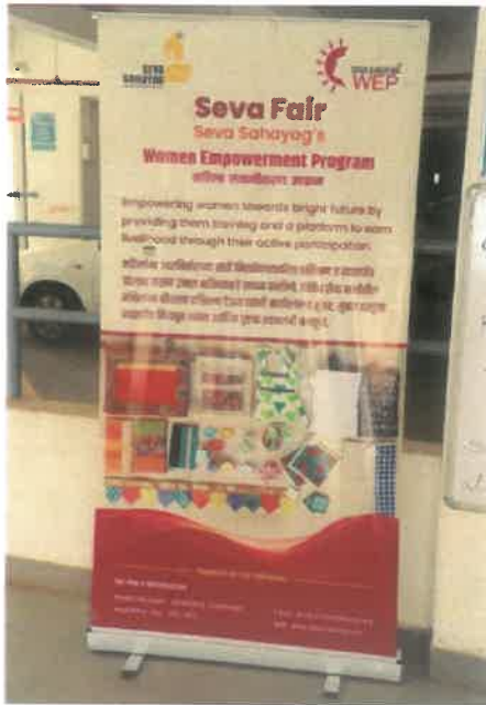
Flyer of Event