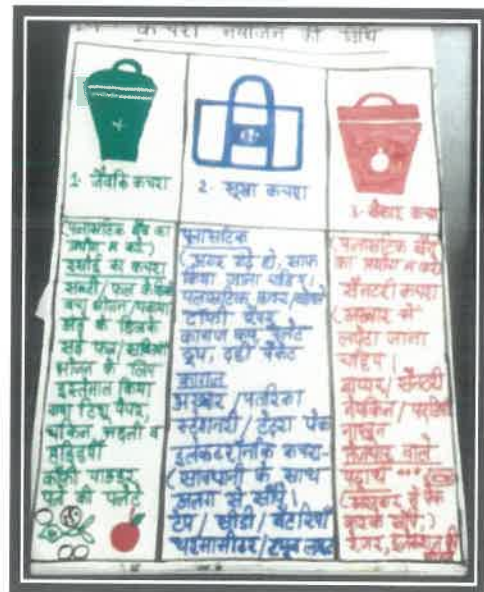
Poster Regarding Waste Management