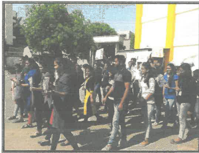
Glimpses of rally