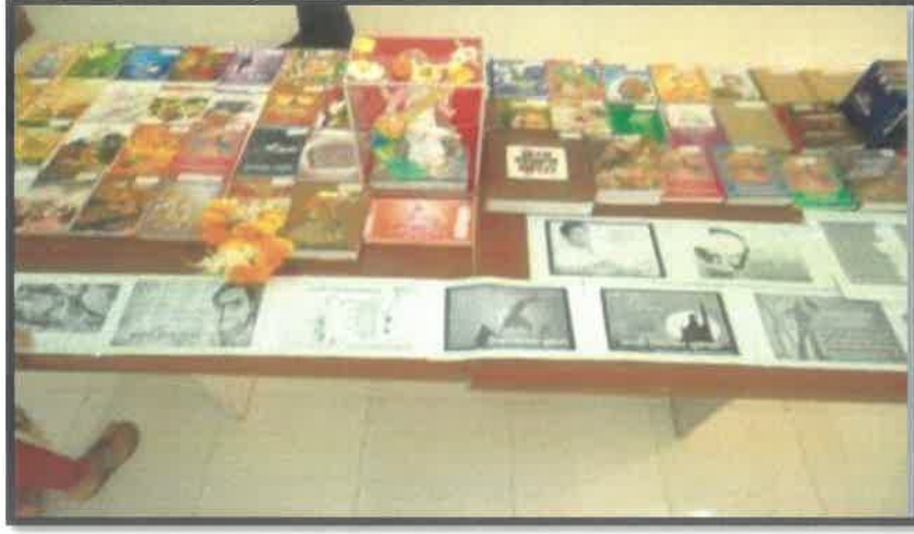
22nd January 2021 in- house Book Exhibition at SBPIM Library