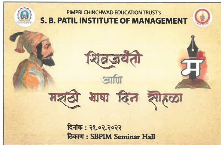
Flyer of Event