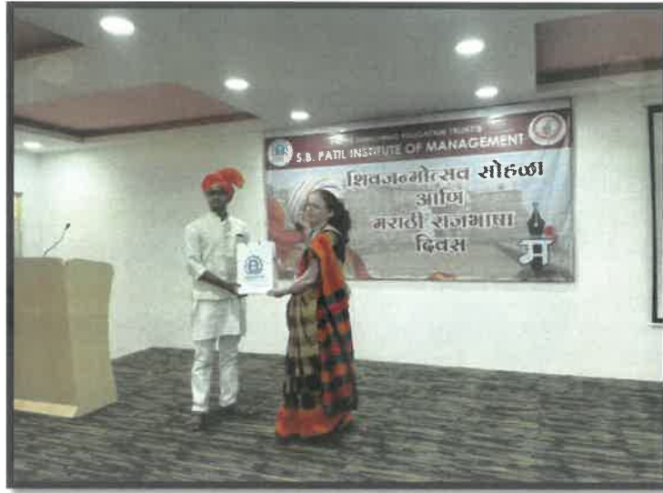
Felicitation of Guest