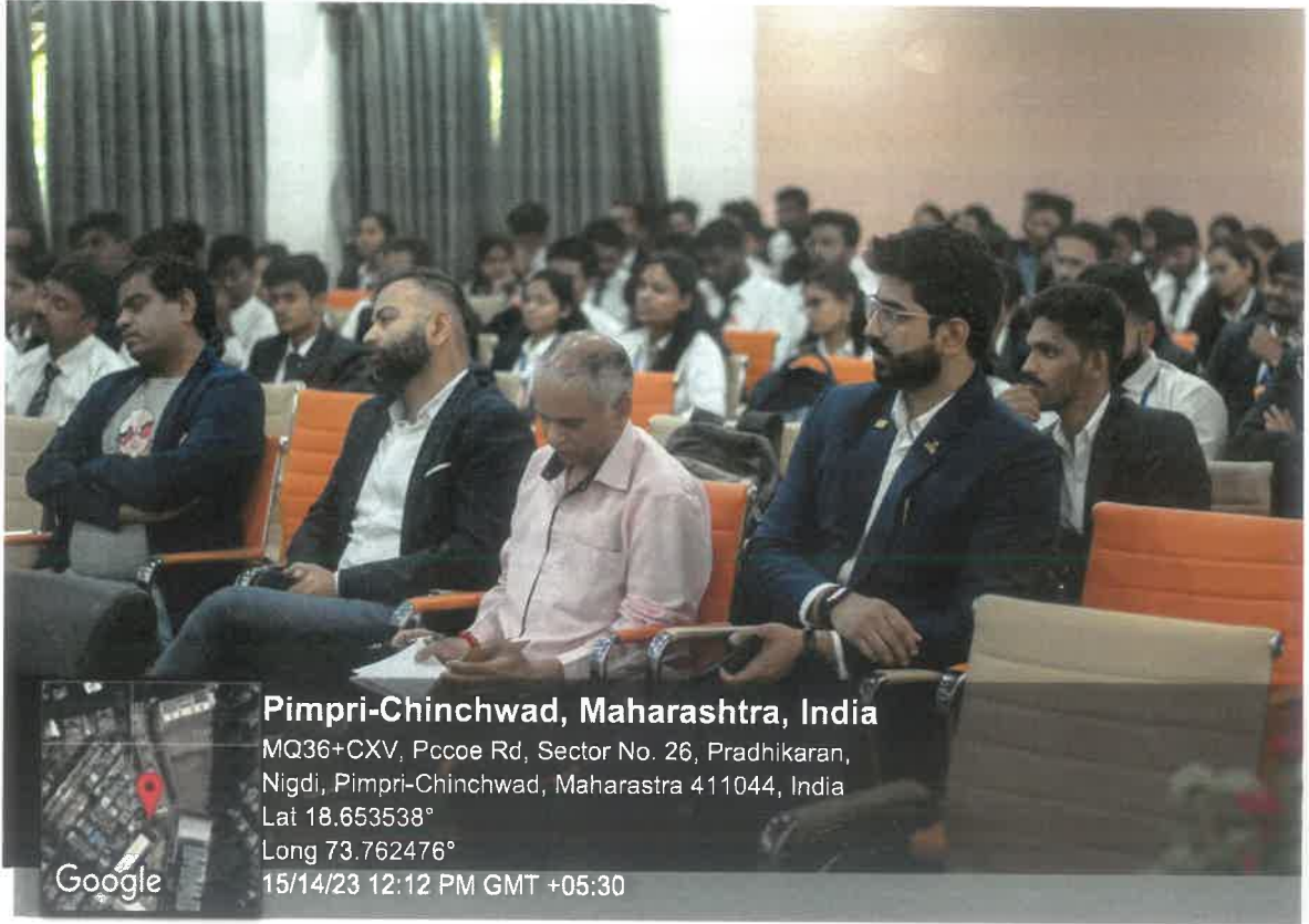
SBPIM Students', CII Members and Faculty members while attending Panel Discussion