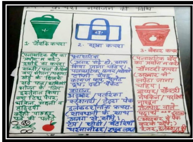
Posture Regarding Waste Management