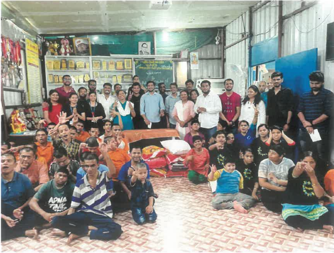
Photo of Orphanage members with SBPIM Teachers and Students