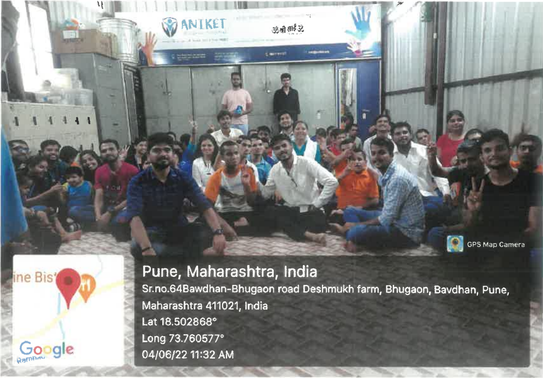
Photo of Students and teachers with special children of Aniket sevabhavi sanstha