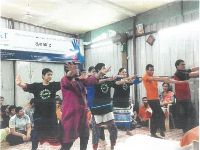
Children showcasing their talent