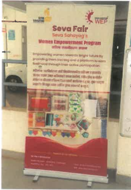
Flyer of Event