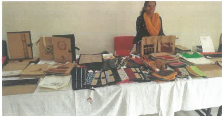
Display of the products by seva sahayog