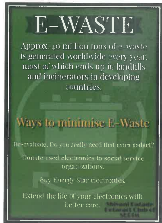
Posters on Management of E - Waste