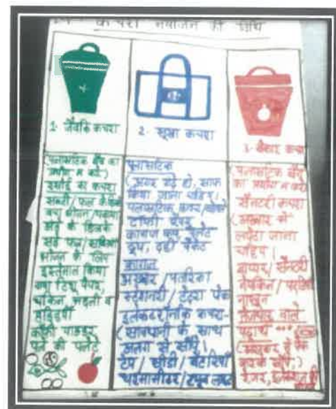
Poster Regarding Waste Management