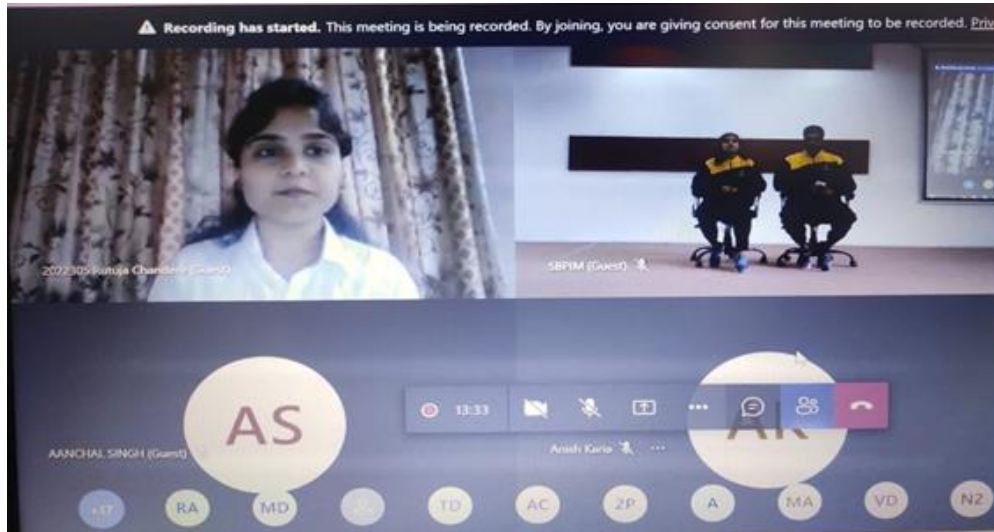
Screen shot of Online meet