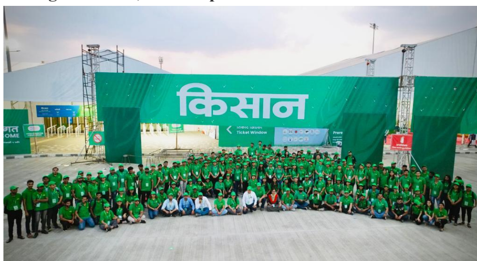
All volunteers At Pune International Exhibition & Convention Centre Moshi on 18 December 2022

God gave us green. Now, let’s keep it clean