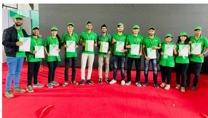
All the student volunteers participated in the event along with their certificate of appreciation on 18 December 2022