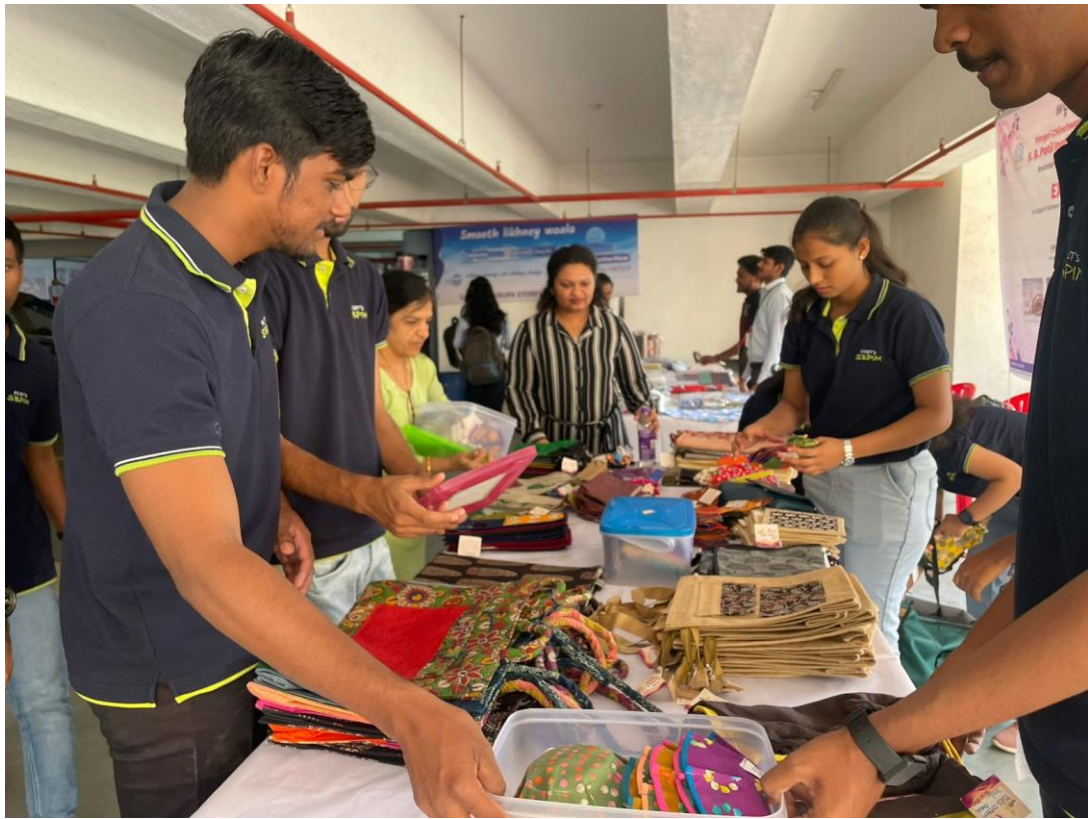
SBPIM Students Helping the womens in the exhibition