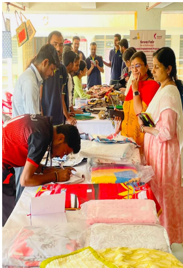
Seva Sahayog Foundation and Tana Bana Exhibiting their products for sale