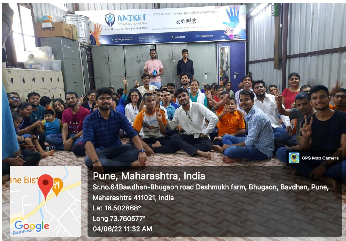
Photo of Students and teachers with special children of Aniket sevabhavi sanstha