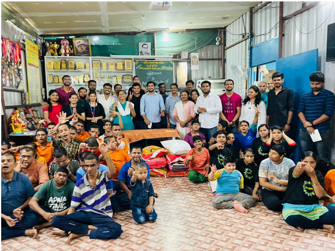
Photo of Orphanage members with SBPIM Teachers and Students