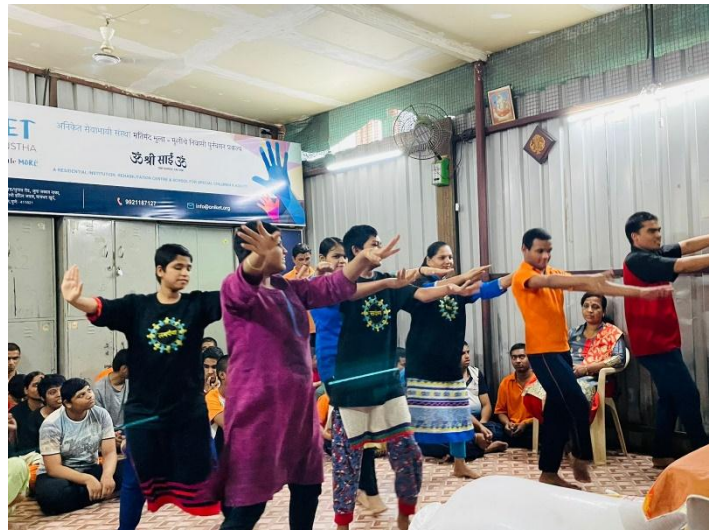
Children showcasing their talent