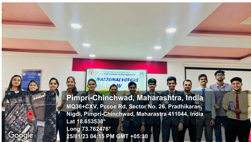
Geo tag Photo of Students with Voters card