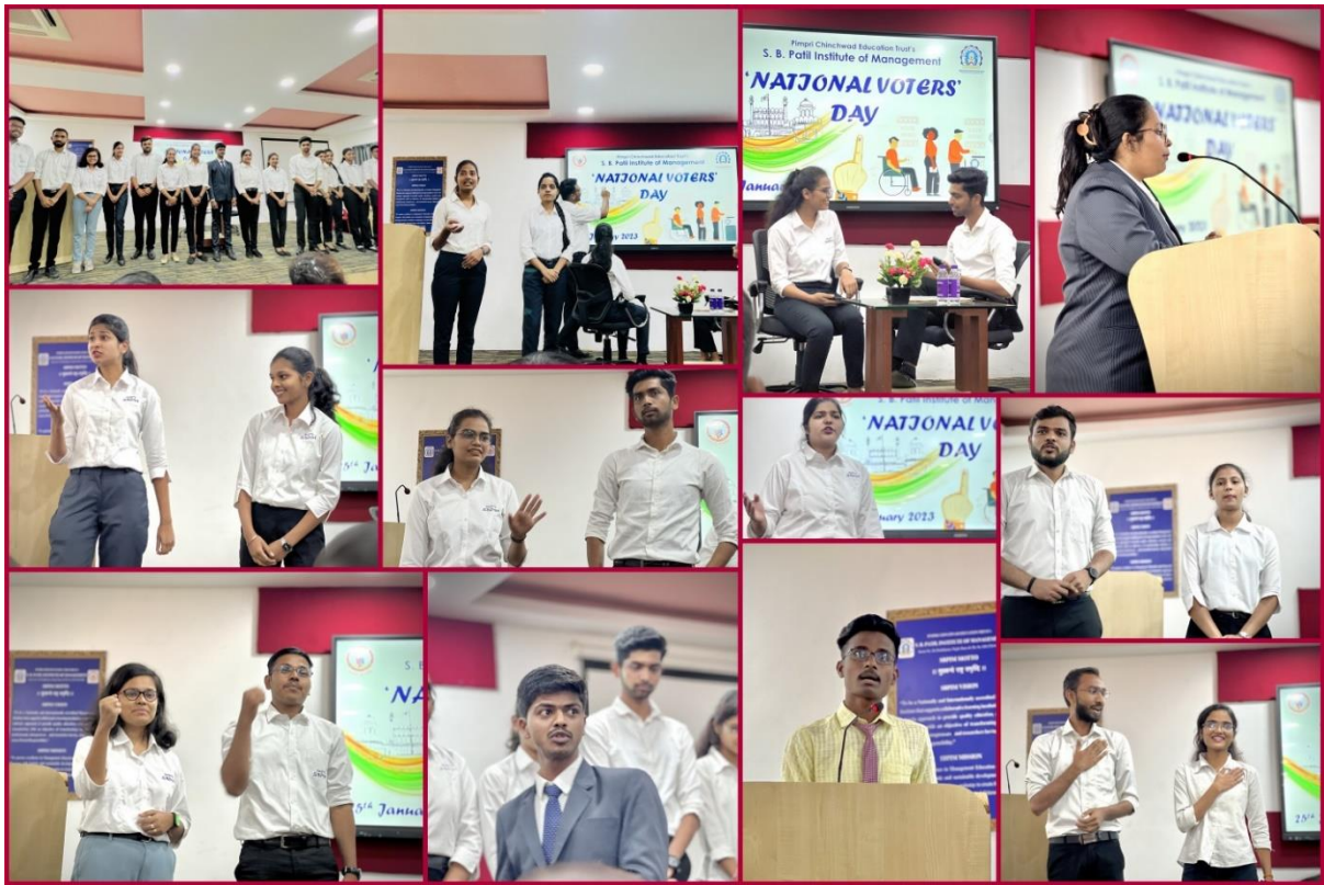
Students presenting a skit with great enthusiasm