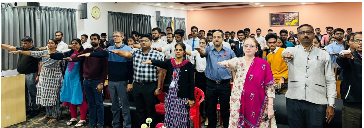
Faculty and staff taking up the pledge