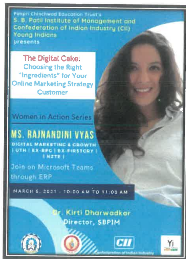
Flyer of Guest Session