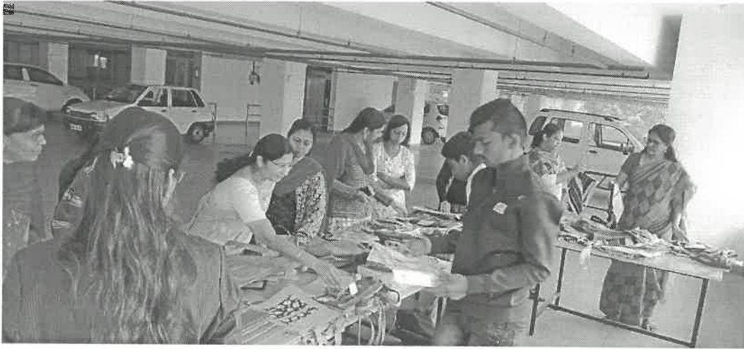
Exhibition on 26 th January 2020 at Architecture Parking Space