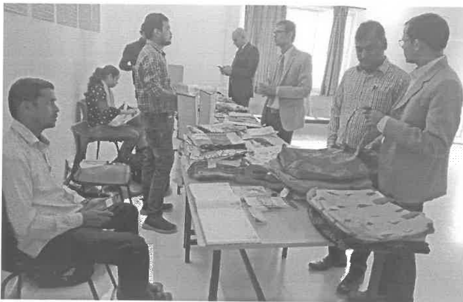
Faculty members showing interest in the products