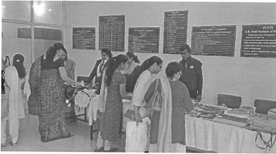
SBPIM Students marketing the products