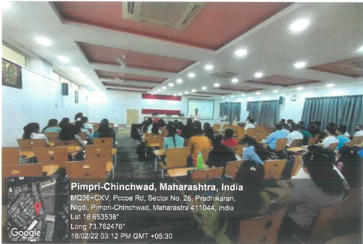
Guest Addressing students