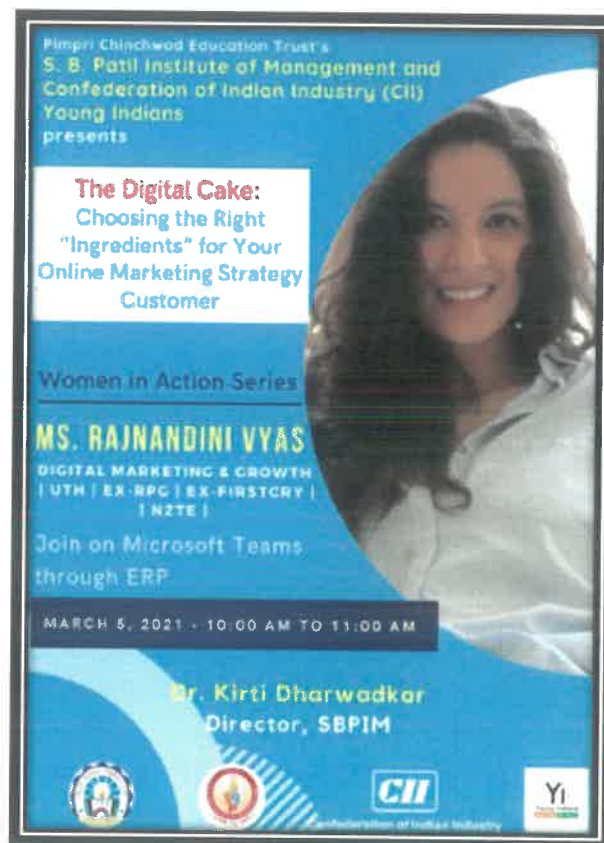
Flyer of Guest Session