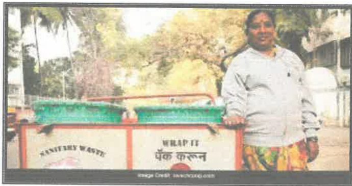
Swachh Worker with the sanitary waste

Swachh Bharat and Clean India are matters of National Priority for every Indian. Pune and PMC's waste-pickers handle about 40 thousand kilograms of DIRTY DIAPERS and SANITARY PADS everyday, exposing themselves to diseases like Staphylococcus, hepatitis, E- coli, salmonella and typhoid. Sanitary waste is silent and a mounting problem in India. Every day, Swachh workers collect 6.5 lakh kilograms of waste from over five lakh houses of Pune,