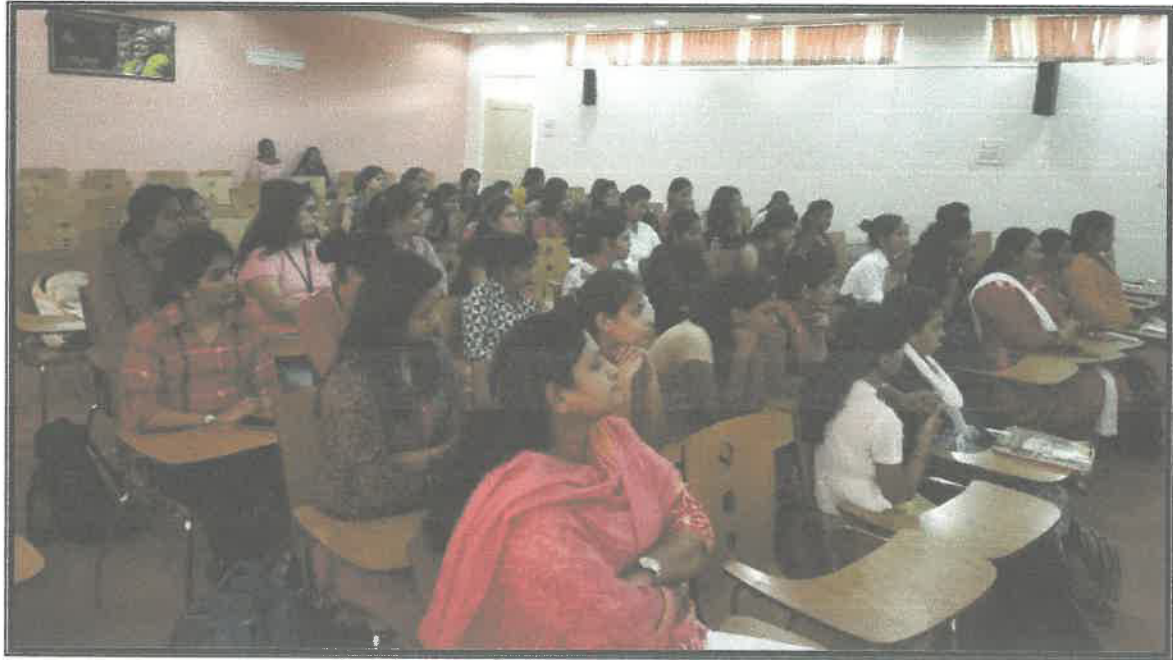
Female staff and Students engrossed in the session