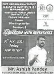
Flyer Guest Session 30-04-2021.jpeg 188K

"To pursuit excellence in Management Education and Research Program with holistic and sustainable developmental approach through dynamic workforce as mainstay to create future Leaders, Transformative Entrepreneurs and Ethical Citizens who generate value for the Industry, Society and the Nation."