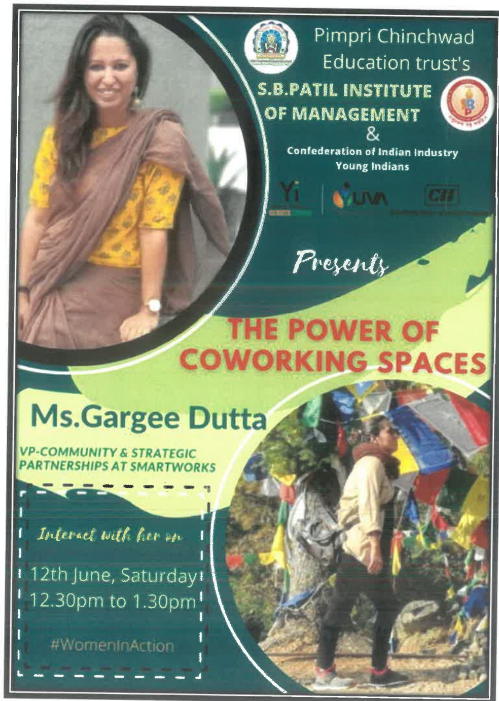
Flyer of Guest Session