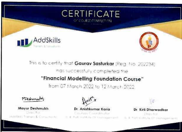
Sample Certificate for successful completion of Financial Modeling Foundation Course Module