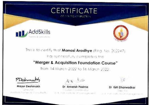
Sample Certificate for successful completion of Merger and Acquisition Foundation Course Module