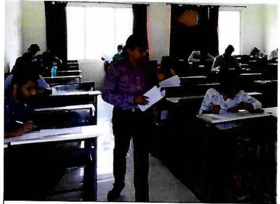
Students appearing for Evaluation in Classroom