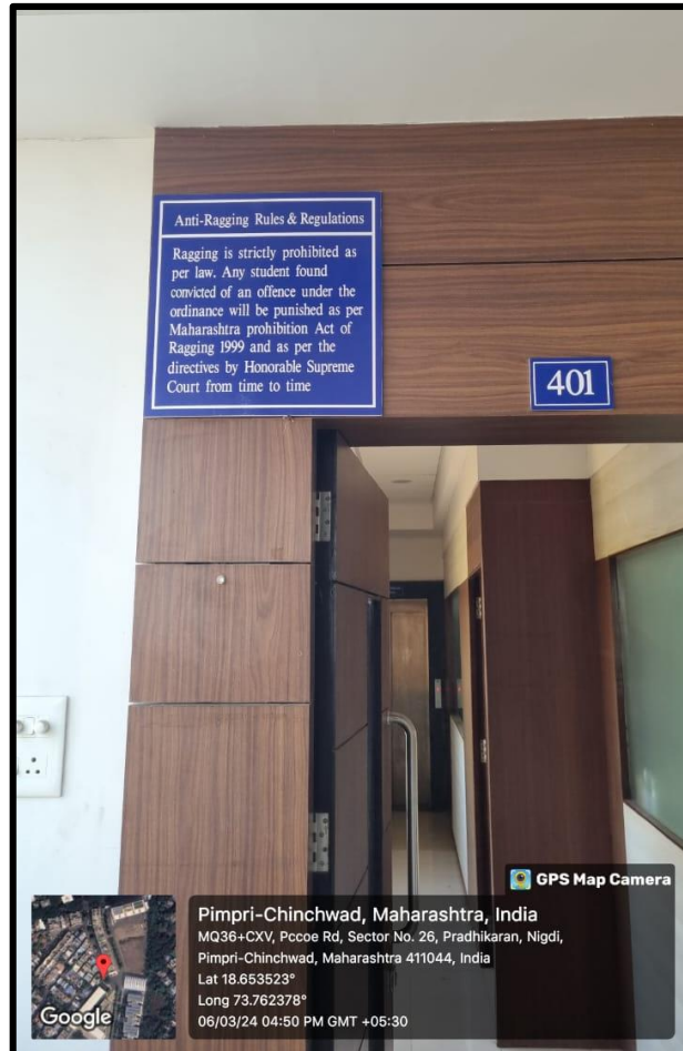
Display of anti-ragging board for students' awareness at SBPIM Building First Floor