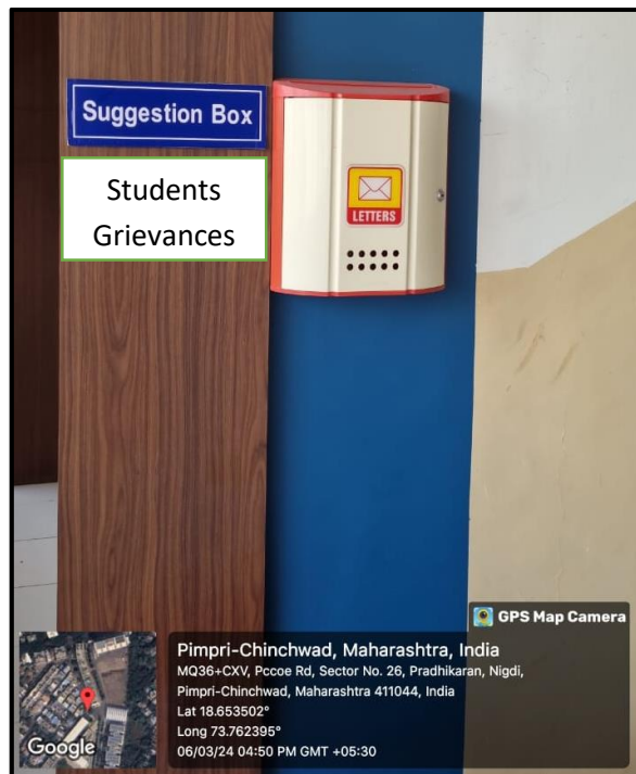
Photo-2 of Complaint box for Students Grievances