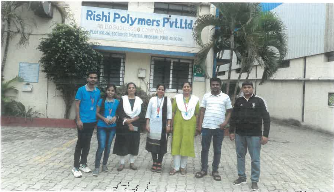
SBPIM faculty and students along with HR @ Rishi Polymers