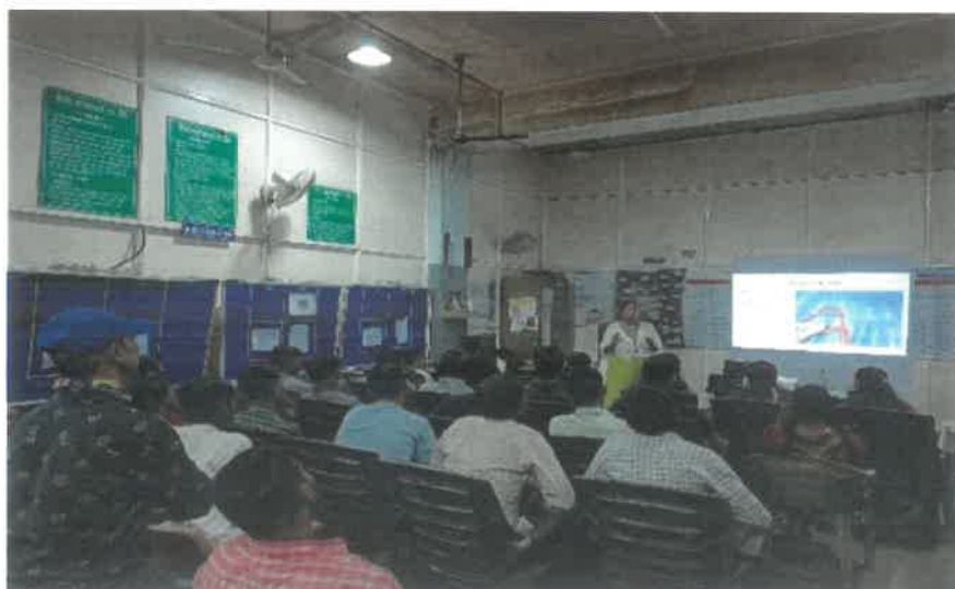
Dr.Iram conducting a session on Health for the workers at Rishi Polymers