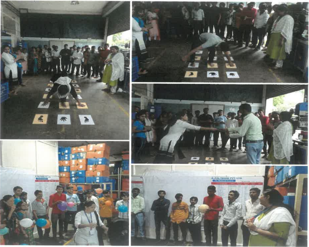
Participants enjoying the activities