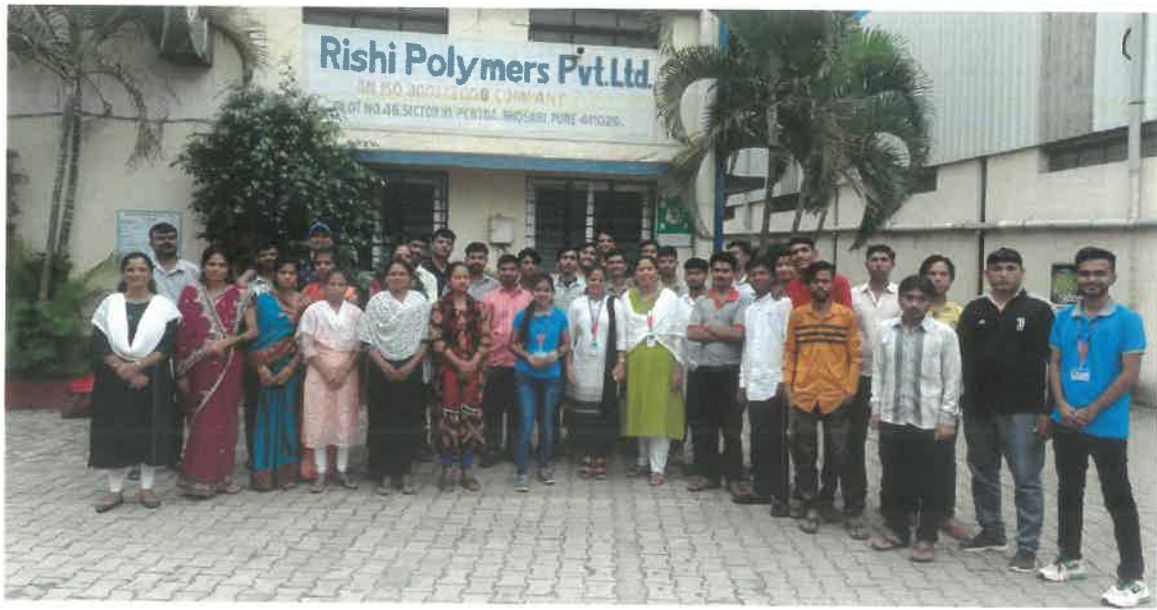
Group Photo of all the participants at Rishi Polymers