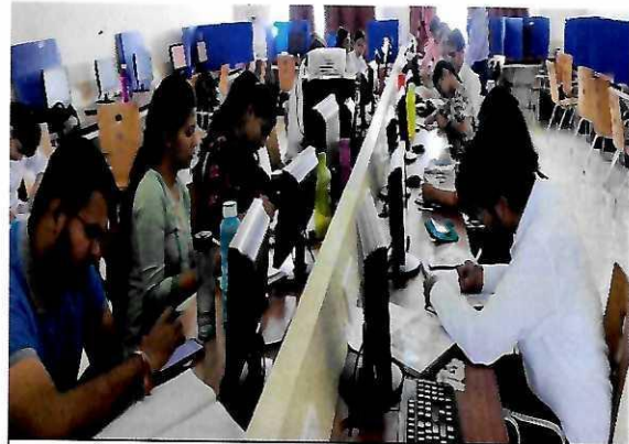
Evaluation of Participants for Certification Course in Finance