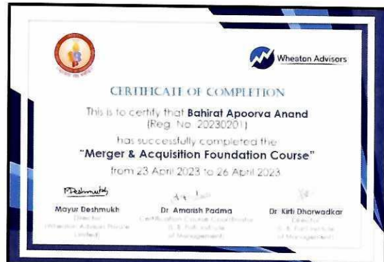
Sample Certificate for successful completion of Merger and Acquisition Foundation Course Module