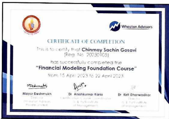
Sample Certificate for successful completion of Financial Modeling Foundation Course Module