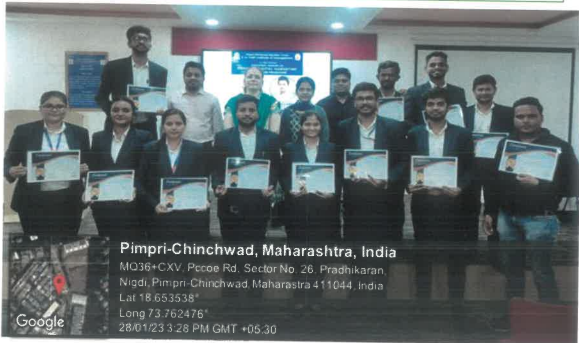
Group Photo of the Students Completed the Advance Digital Marketing Certification Program