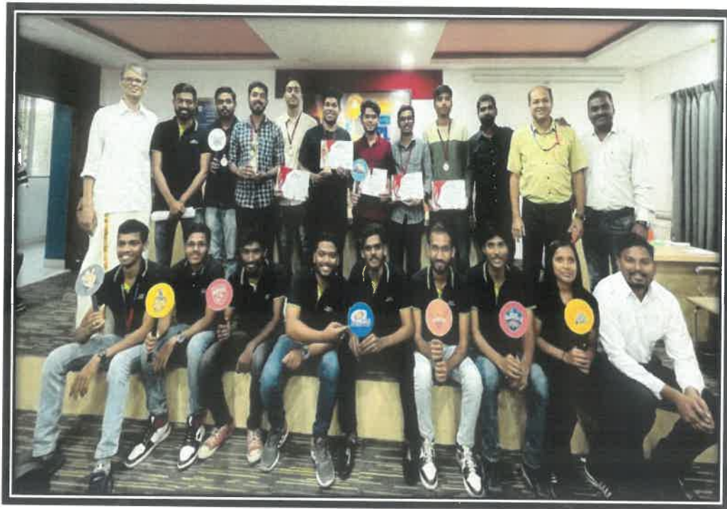
Intercollege Winners of IPL Auction