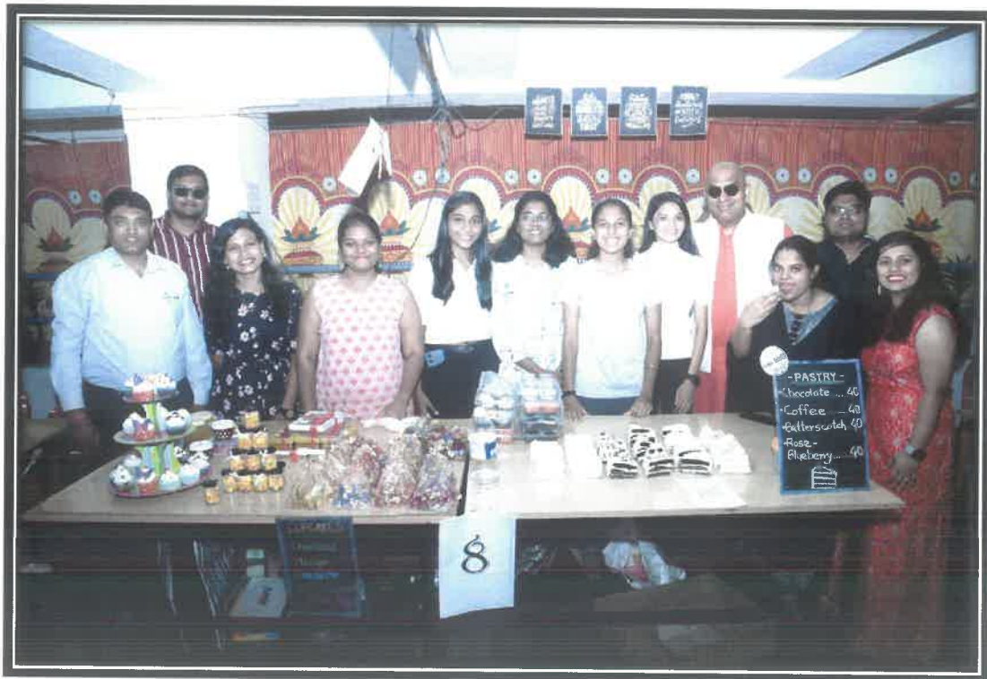
Participants for Business Funfair