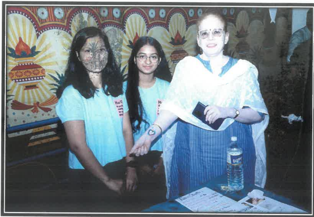
D. Y. Patil students, participants for Business Funfair