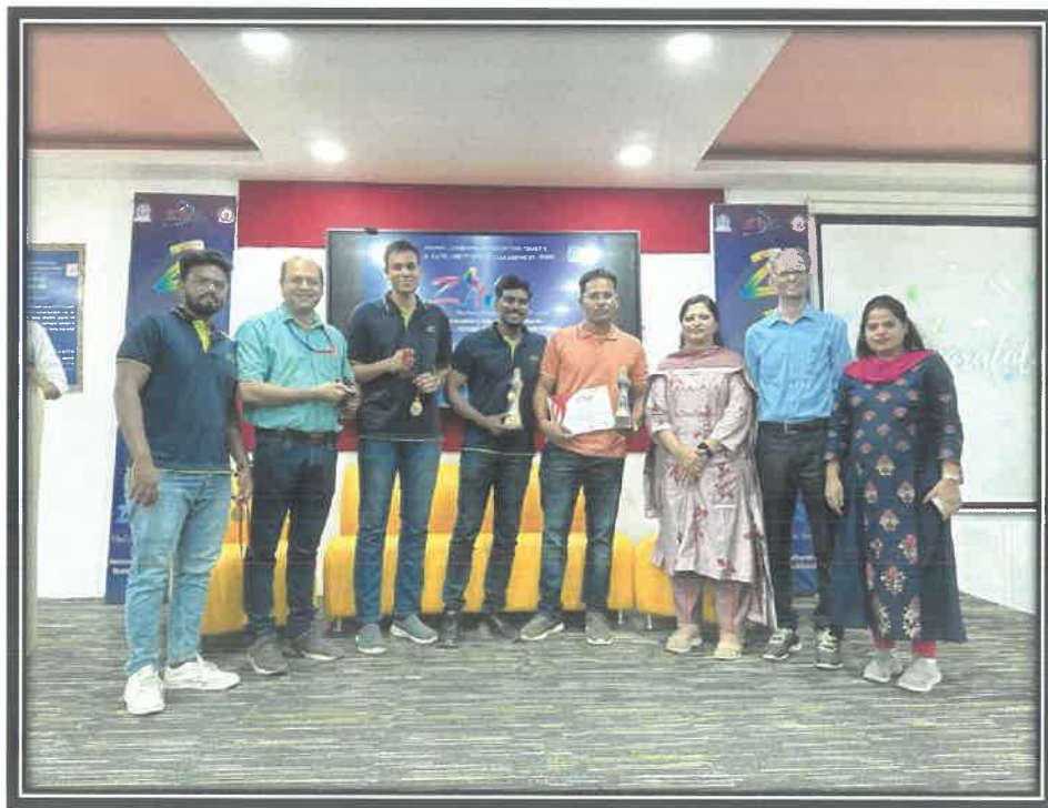
Prize Distribution ceremony