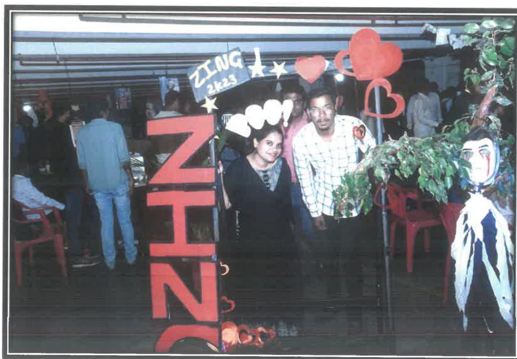
Faculty Coordinator and Student Coordinator