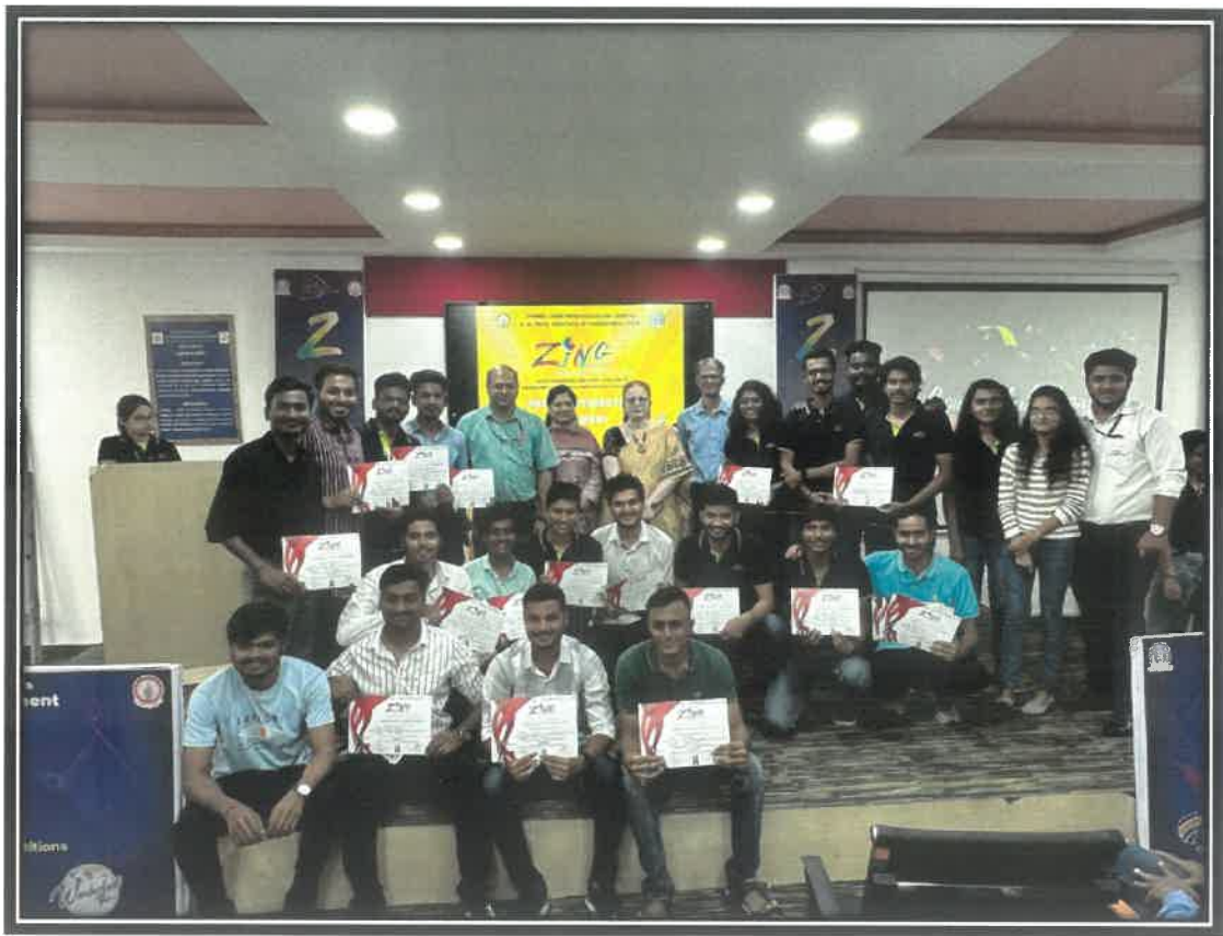
Winners of Intracollegiate competition