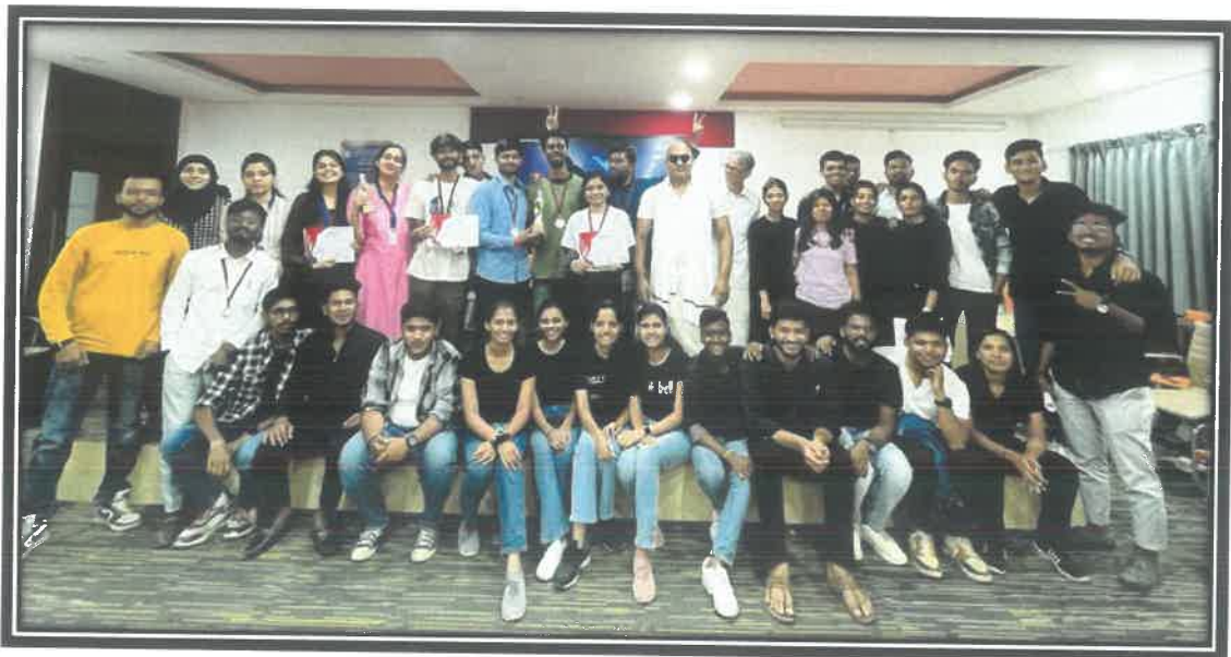
Group Photo of Winner of Intercollegiate IPL Competition Participants along with Volunteers