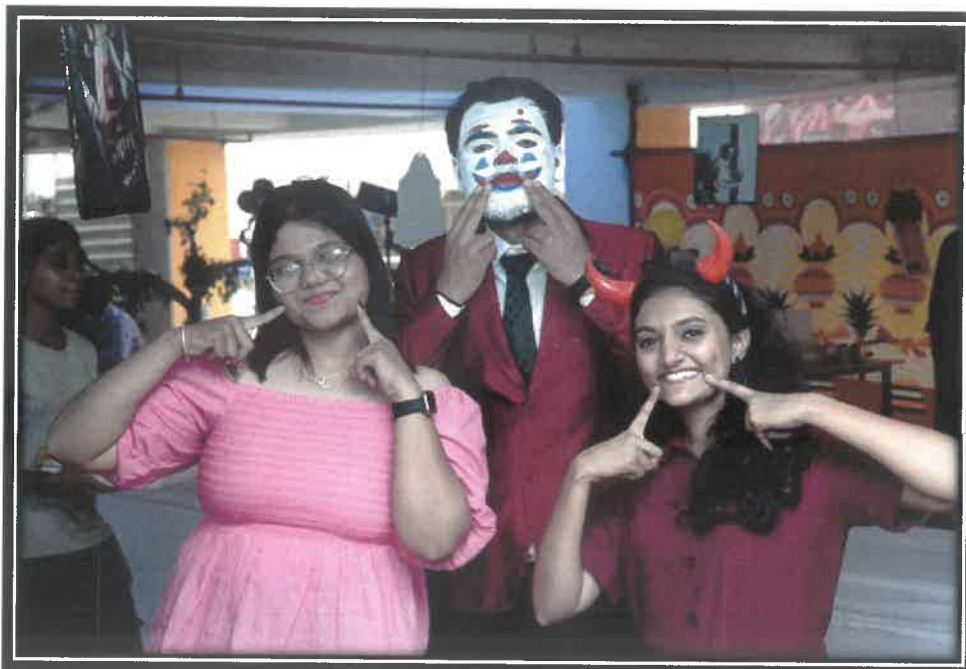
Students Celebrating Hallowe'en Day