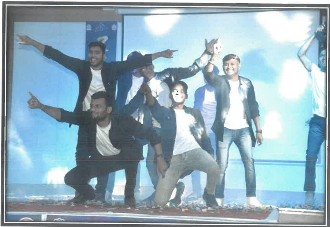
Student Participants in Dance competition