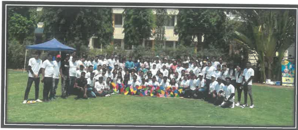
Group photo of Guests, Faculty members and Student Volunteers at Football Lawn