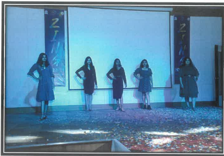
Rock-the-Ramp, Fashion Show Competition