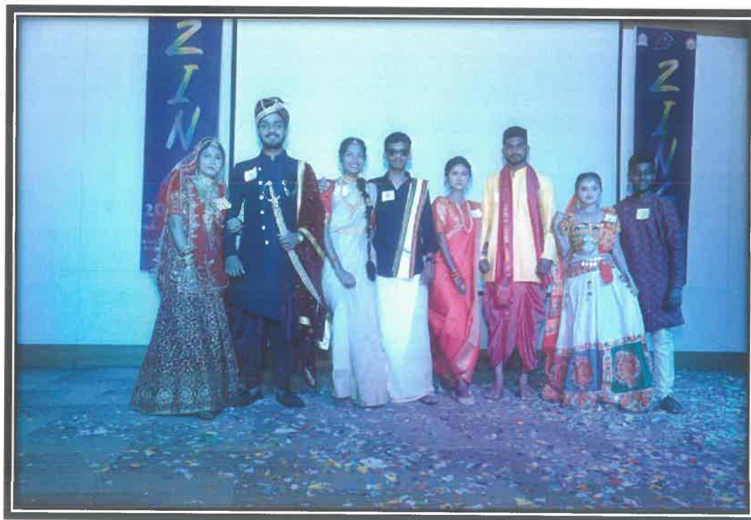
Rock-the-Ramp, Fashion Show Competition