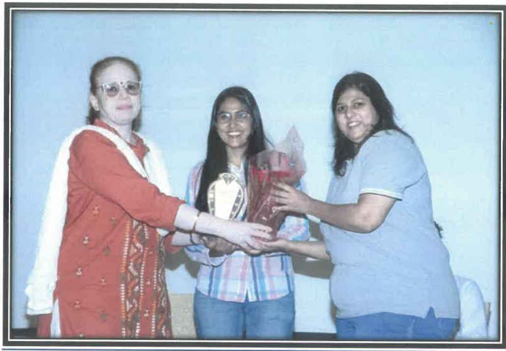
Guests from G.T.S Techno soft