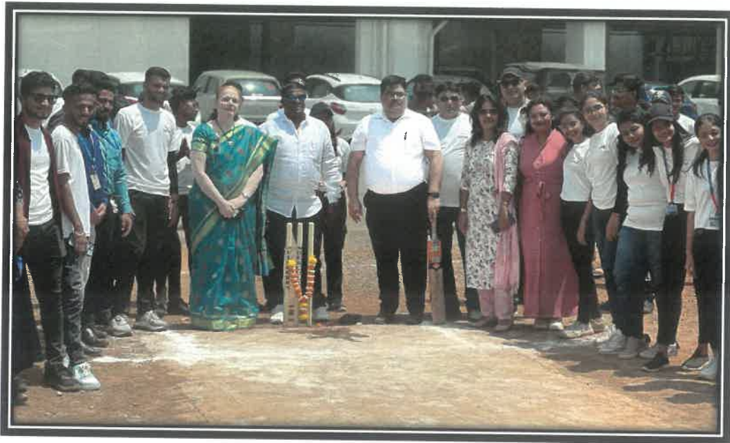
Group photo of Guests, Faculty members and Student Volunteers at Box Cricket