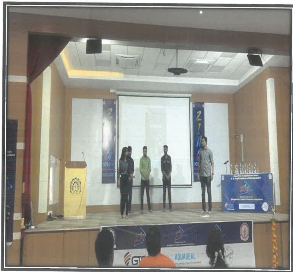
Winners of Intercollege Mad Ads