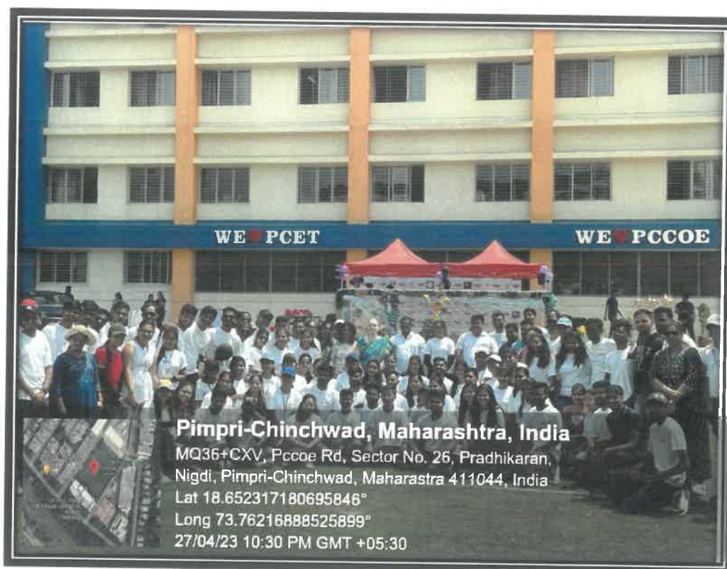
Group photo of Guests, Faculty members and Student Volunteers