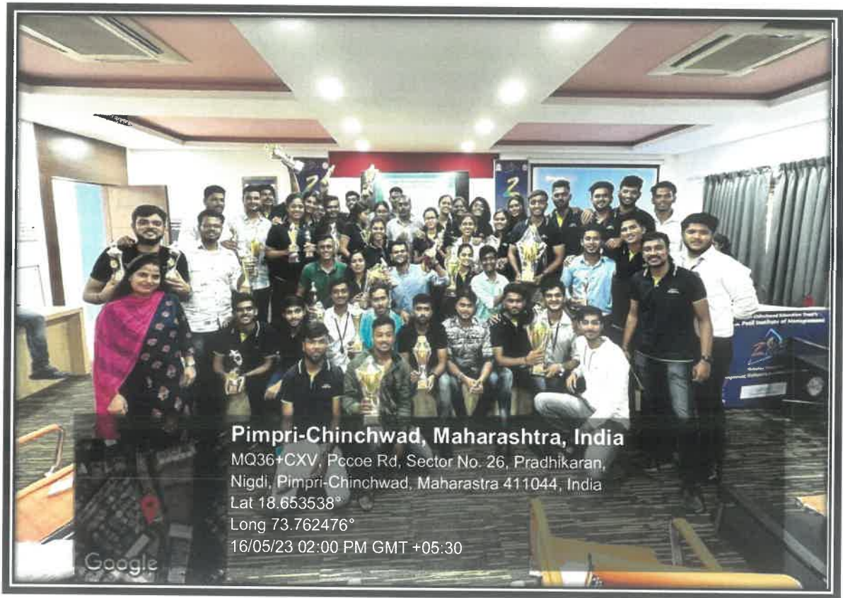
Intra-collegiate Prize Distribution Ceremony: Winners