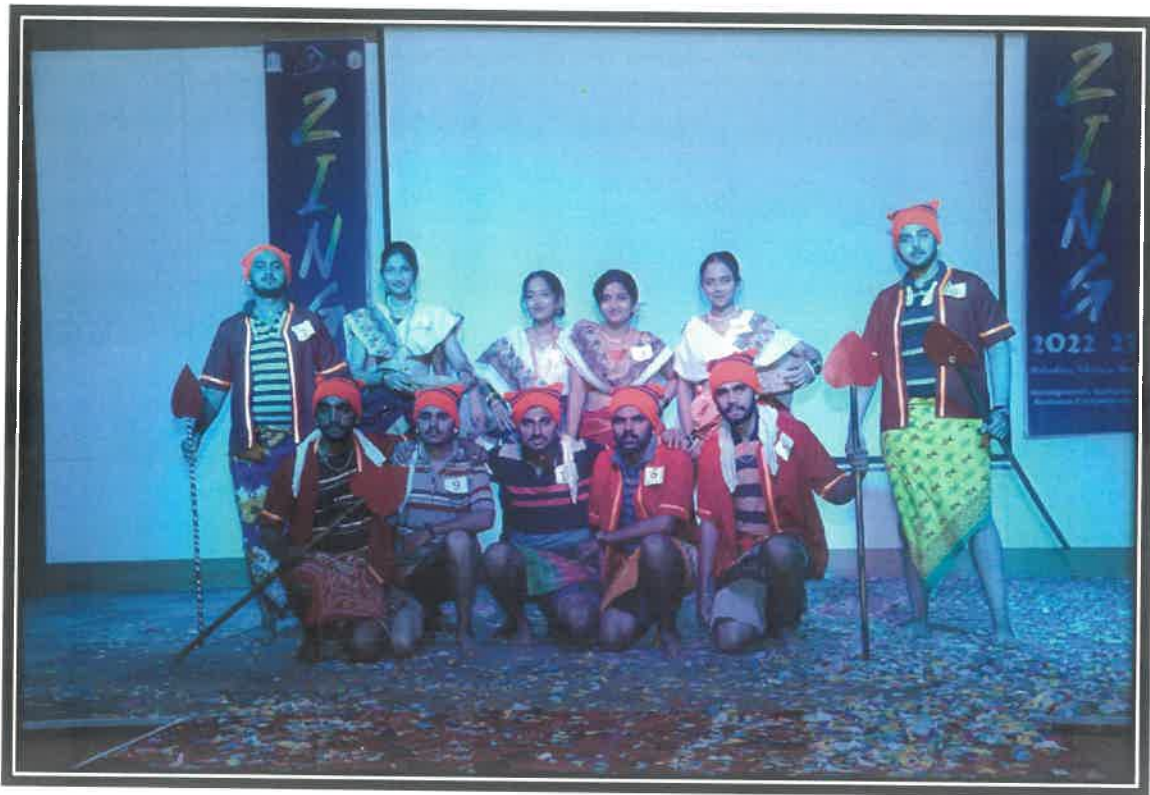
Rock-the-Ramp, Fashion Show Competition