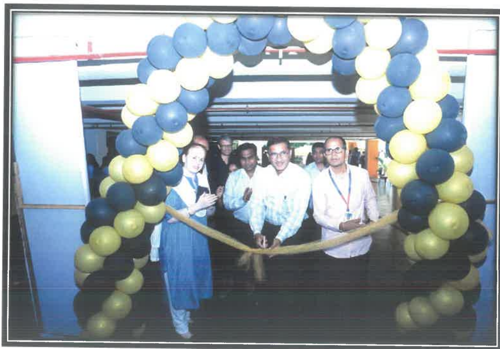
Inaguration of Business Funfair