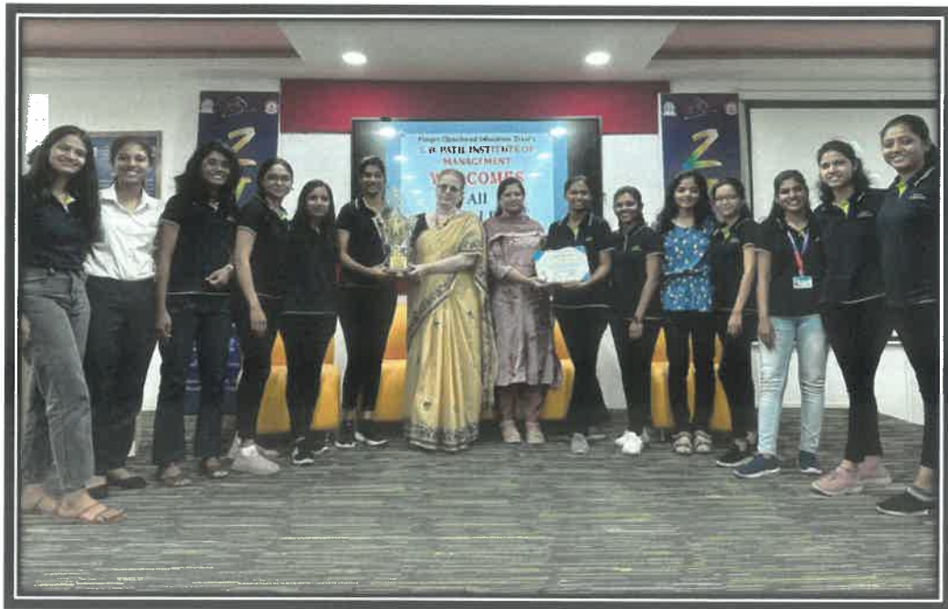
Prize Distribution ceremony