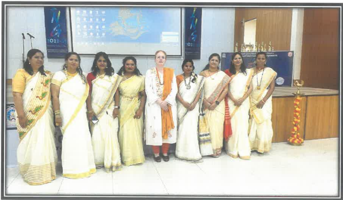
Group Photo of Faculty Members on Traditional Day