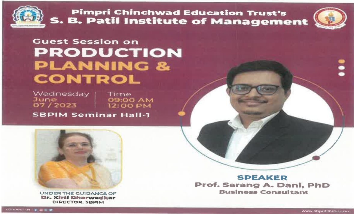
Flyer of the Event