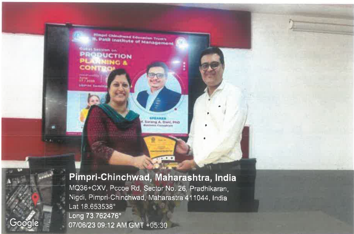
Felicitation of the Guest