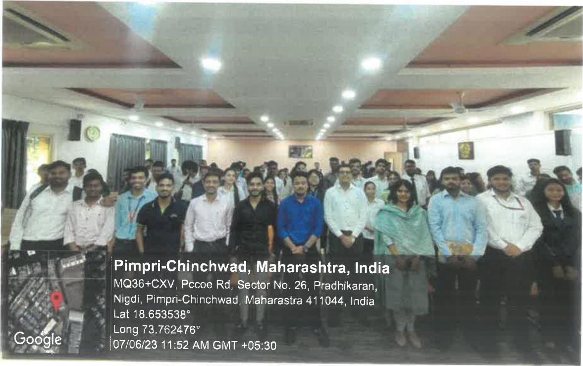
Group Photo at the Event