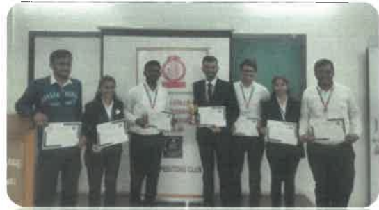
Students photo after Receiving Award at SIP Project Competition