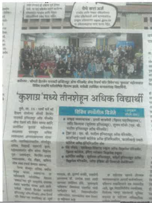
Media Coverage of students participated in Intercollegiate Competition