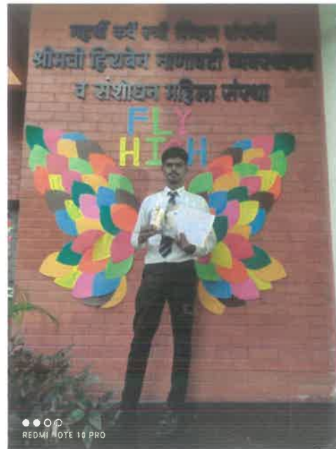
Students photo after Receiving Award at HNMIR