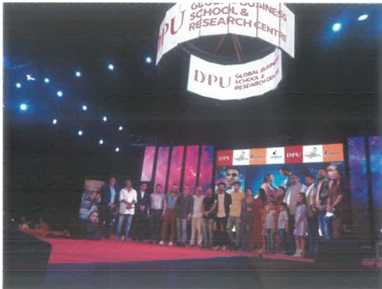
Students attending Prize Distribution Ceremony after Winning at DPU