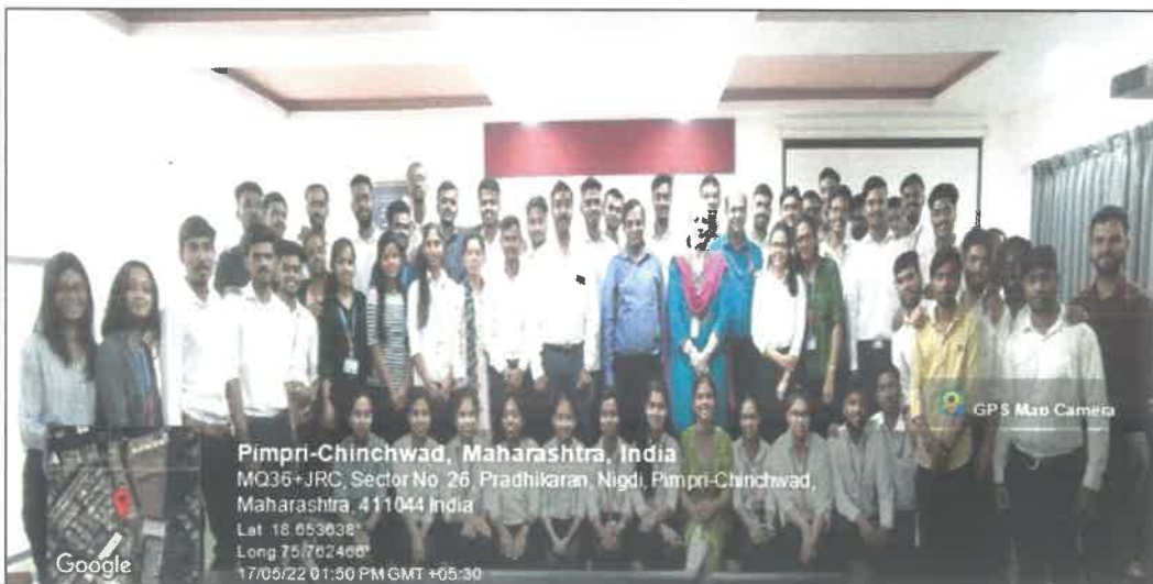
Group Photos of Ethnus Employability Enhancement