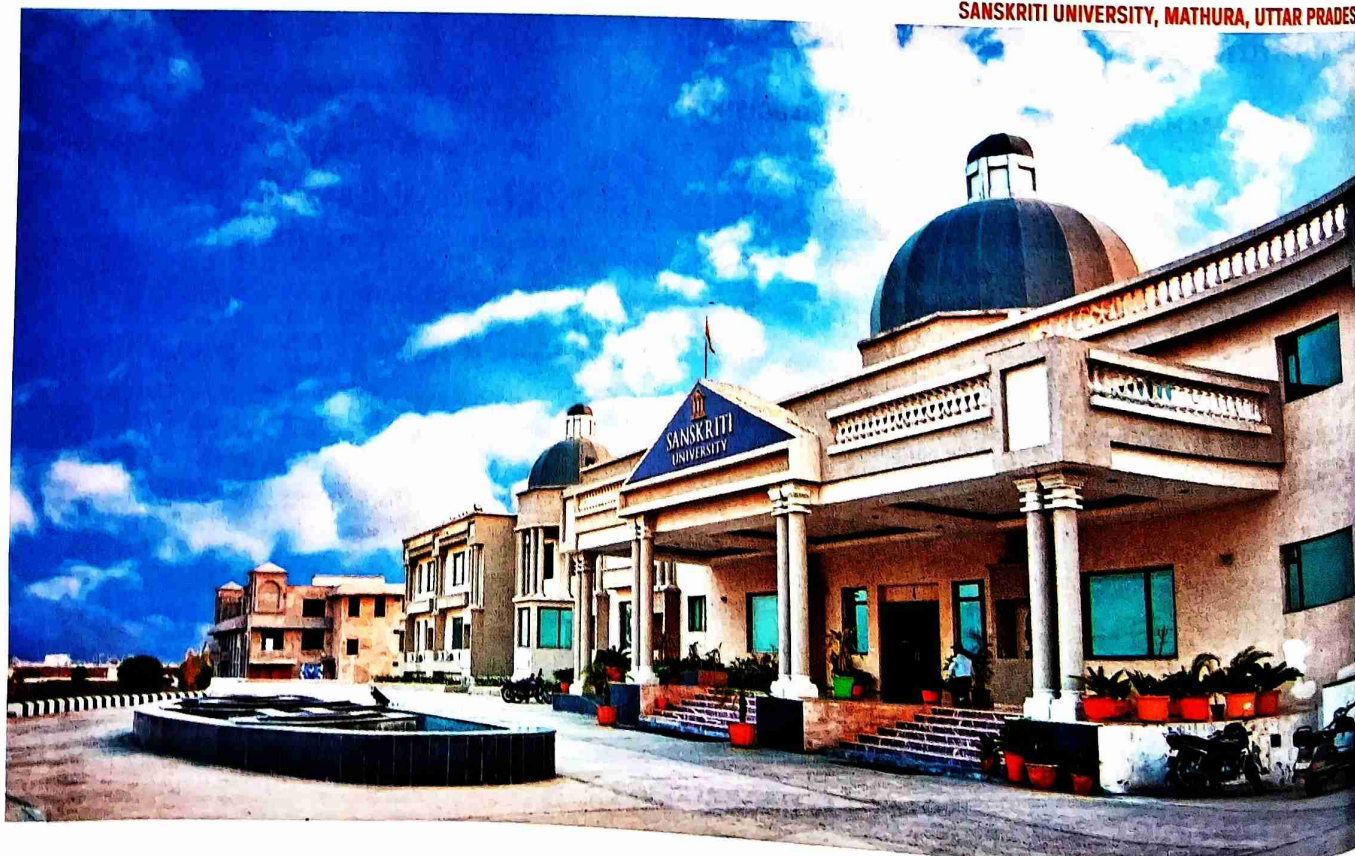
SANSKRITI UNIVERSITY, MATHURA, UTTAR PRADESH