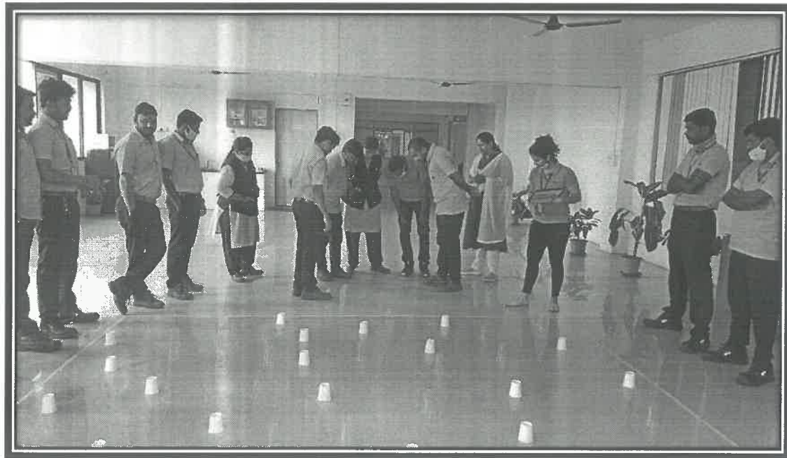
Operators Engaged in Mine game activity.