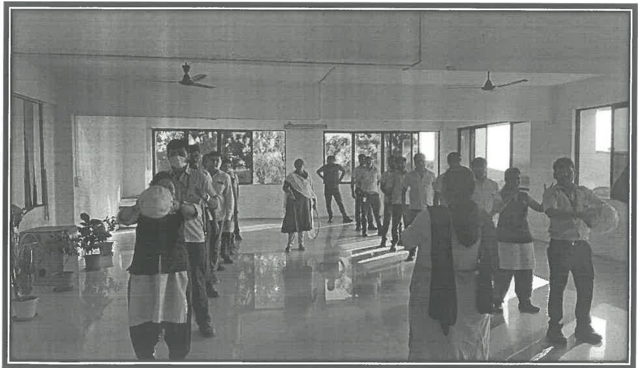
Operators enjoying activities at the session