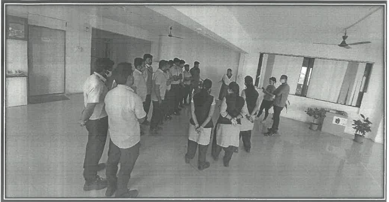
Coordinators conducting activity.