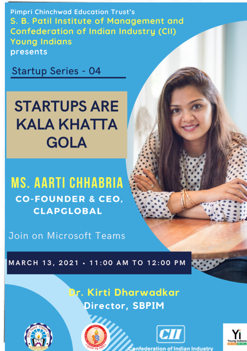
Flyer of Guest Session